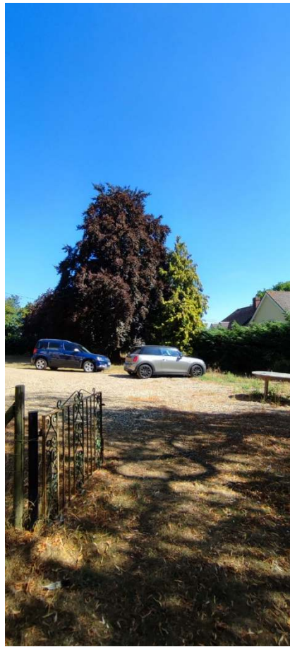
Photo 4 T4 Branch torn and resting on BT service