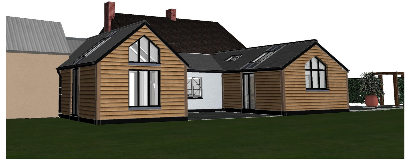
2 Generic Perspective (From North)