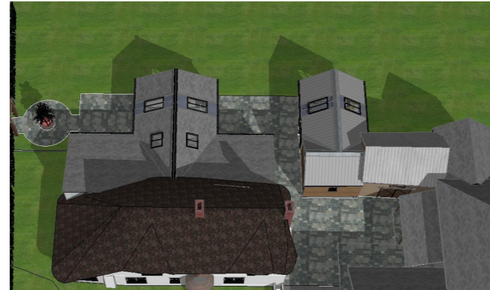
6 Generic Perspective (Above Alt 75m )