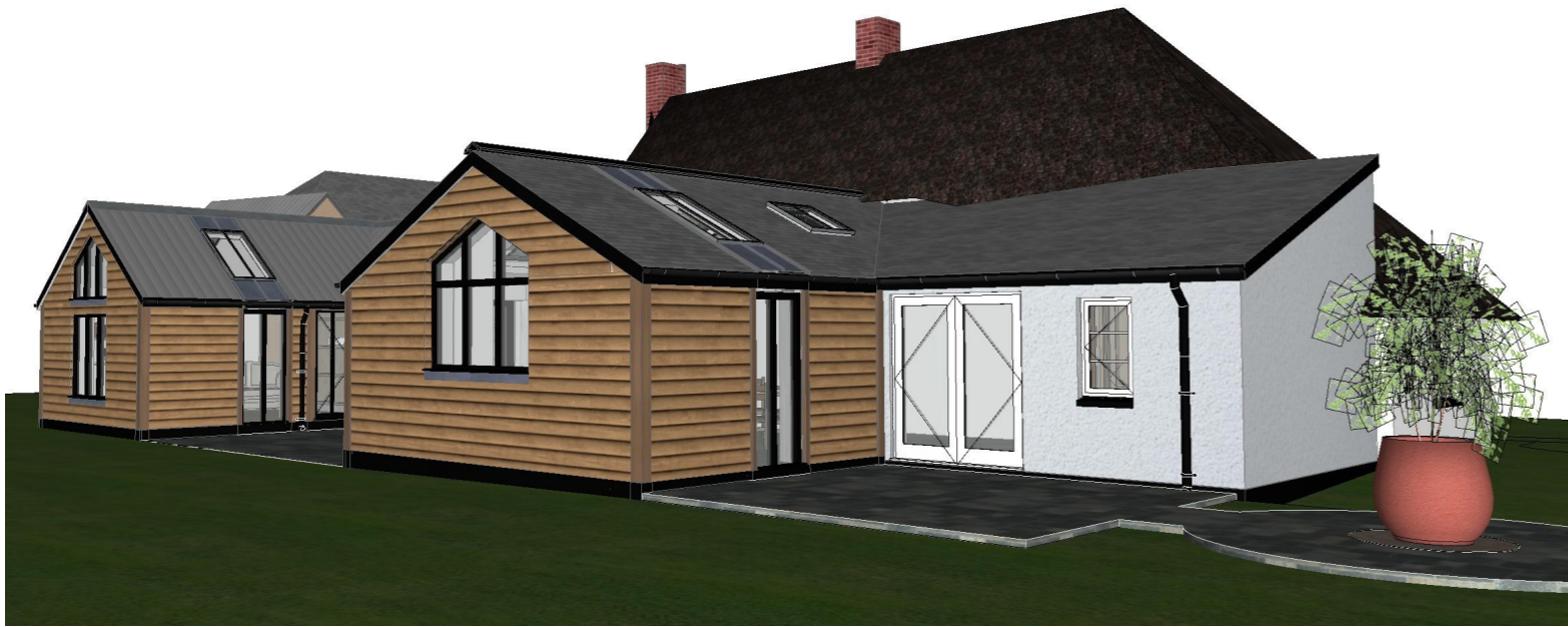
1 Generic Perspective (From West )