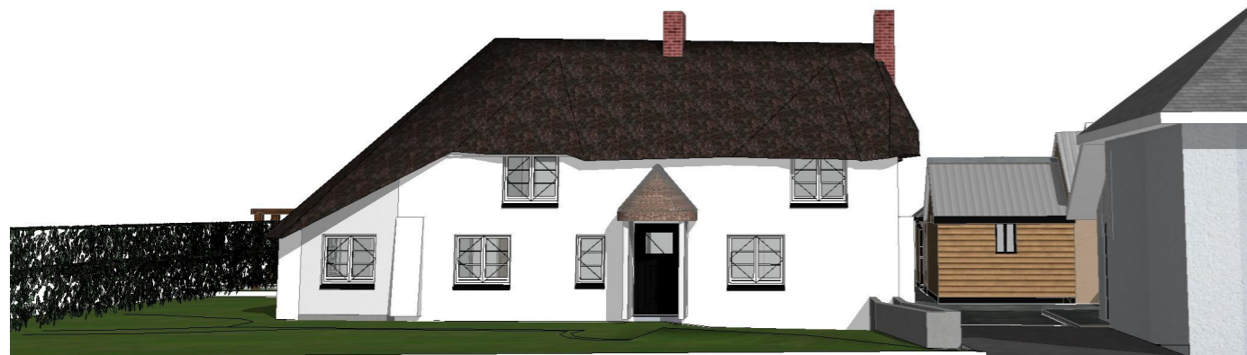
3 Generic Perspective (From Road )