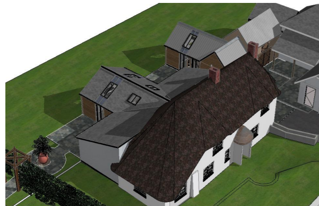
5 Generic Perspective (From South - Alt 75m )