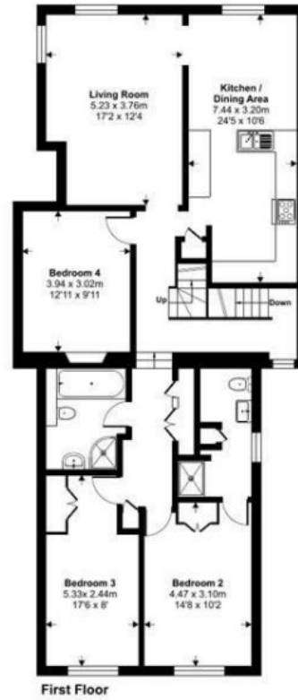
Existing floor plan