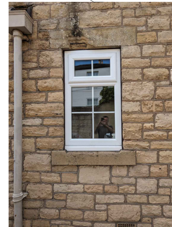
Ground Floor Staff Communal Room