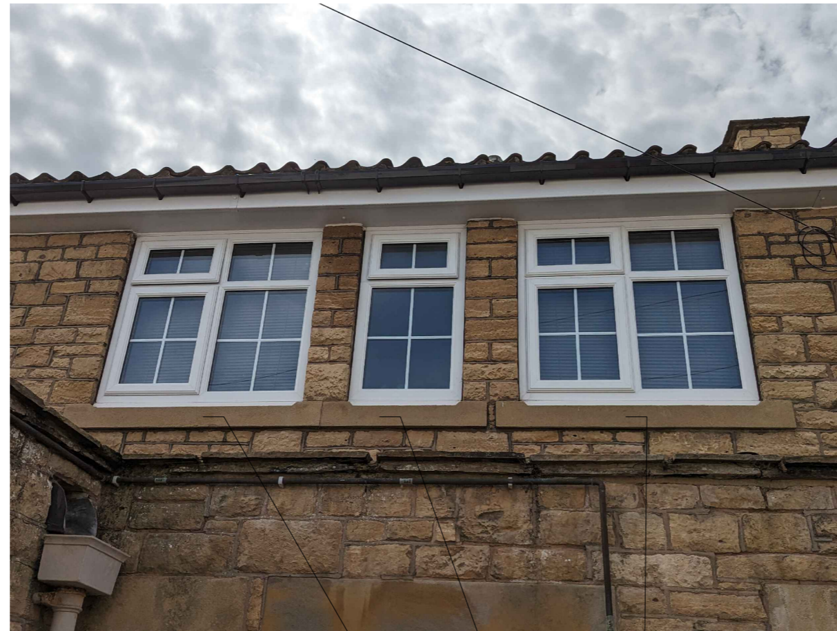
First Floor WC (Left & Right), Store Room (Central)

©Wildblood Macdonald Architects Ltd, registered in England and Wales no. 8722656 Do not scale, use figured dimensions only. All dimensions are to be verified and checked before the commencement of any shop drawings or work whatsoever, either on his own behalf or for sub contractors or suppliers. Any discrepancies must be reported to the Architect immediately. This drawing is to be read in conjunction with all related architects' engineers' and specialist drawings and other relevant information. If printing from electronic copies, ensure print scaling is set to "None" to ensure correct scaling of drawing.