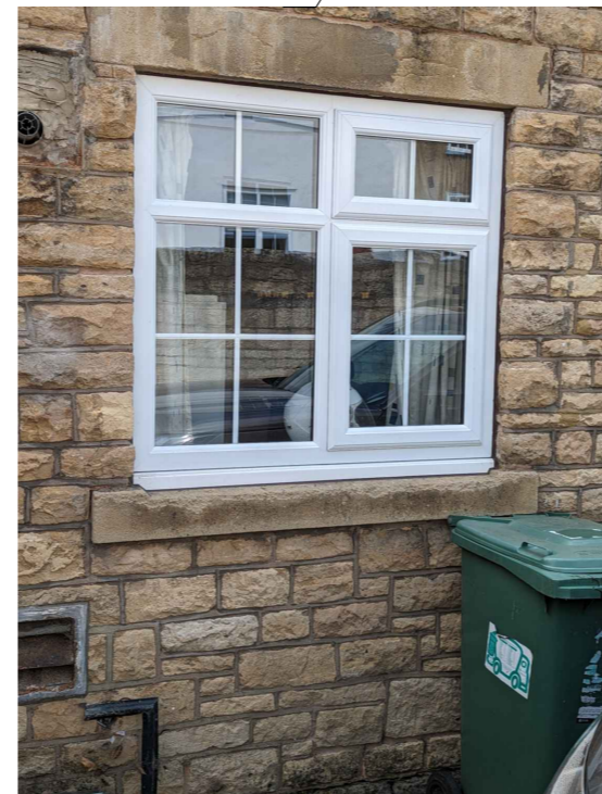
Ground Floor Boiler Room