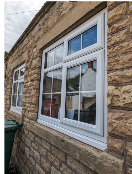
Ground Floor Store Room