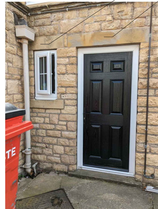
Ground Floor WC and Staff Access Door