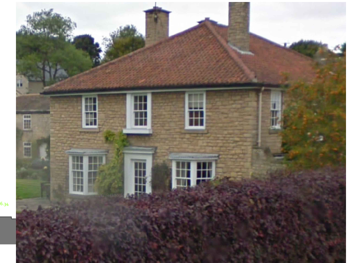
Google Streetview Image from 2009