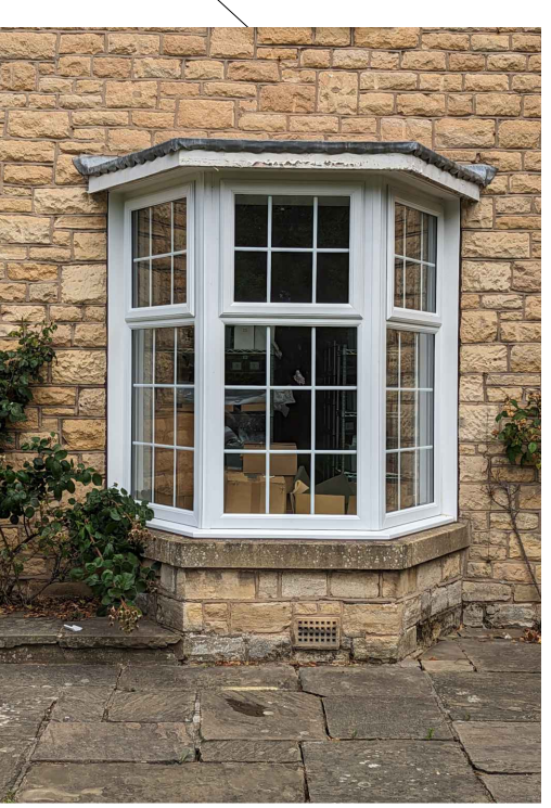
Ground Floor Office Projecting Bay