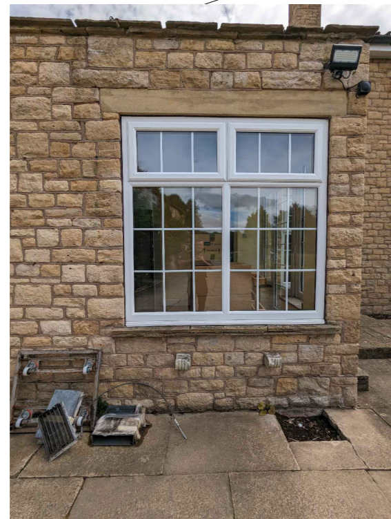
Ground Floor Staff Communal Area