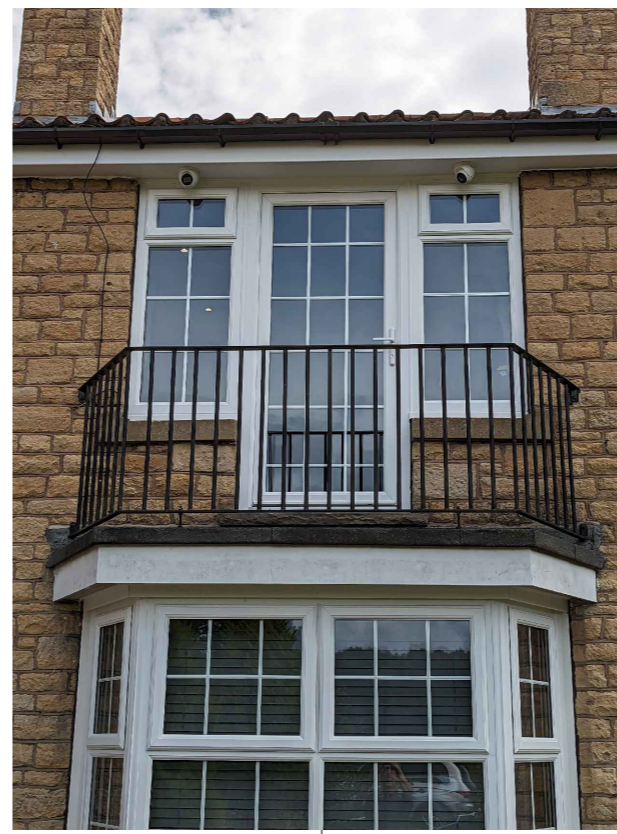
First Floor Office