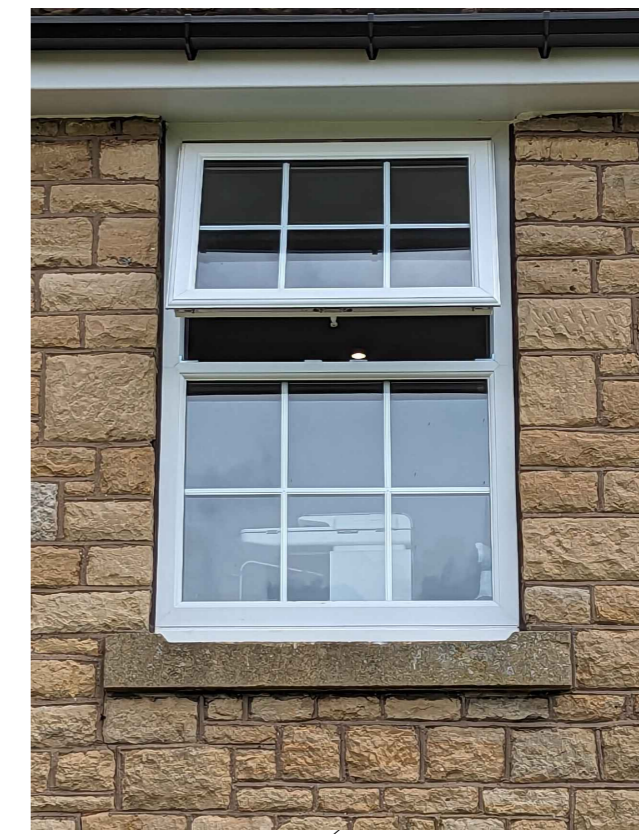
First Floor Office