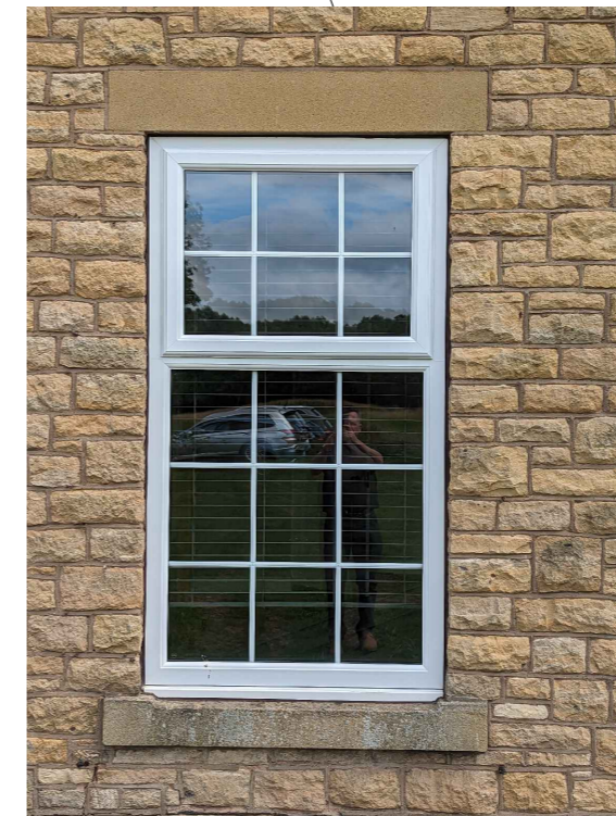
Ground Floor Office