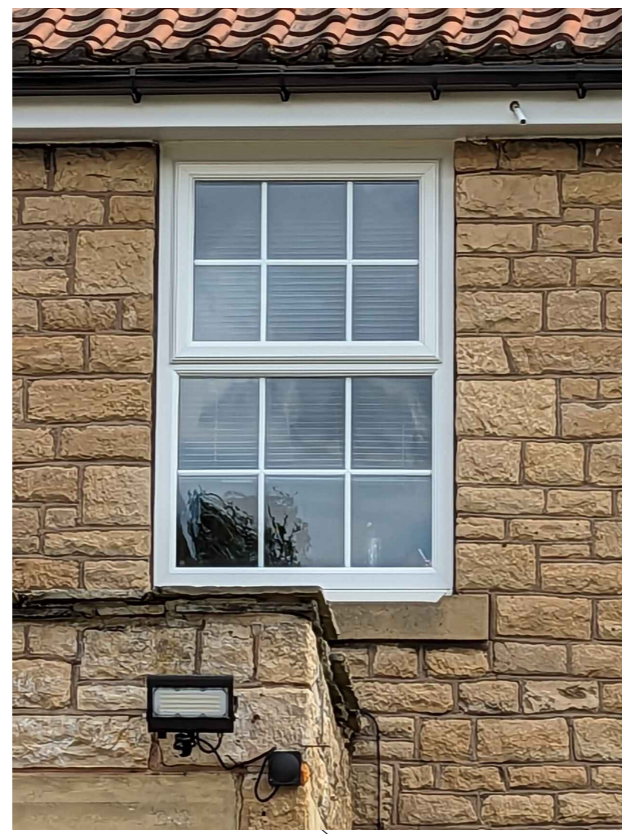
First Floor Office

Window Materials UPVC Framed, Double Glazed. Glazing Bars within the Double Glazed Units. Casement Style, Top Hung Openers.