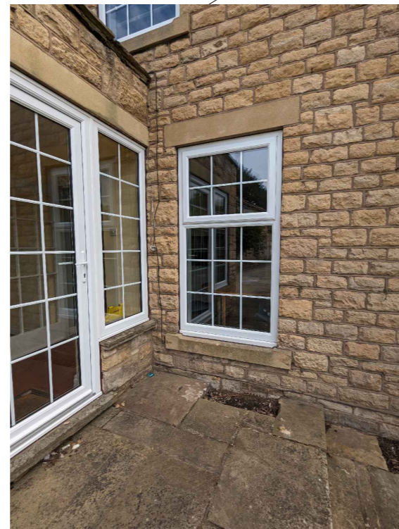
Ground Floor Staff Break Out Area