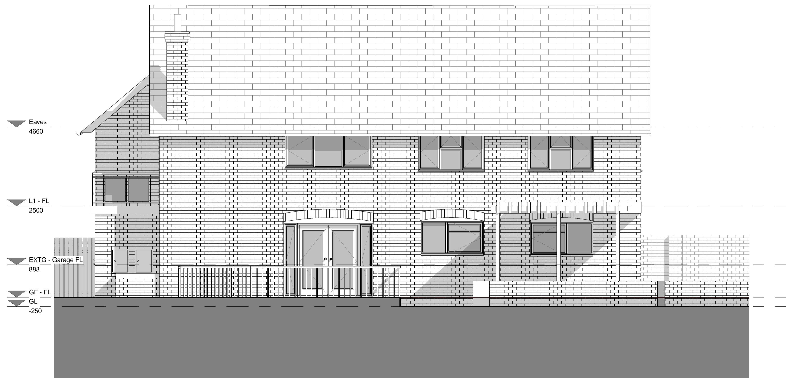
Existing West Elevation 1 : 50