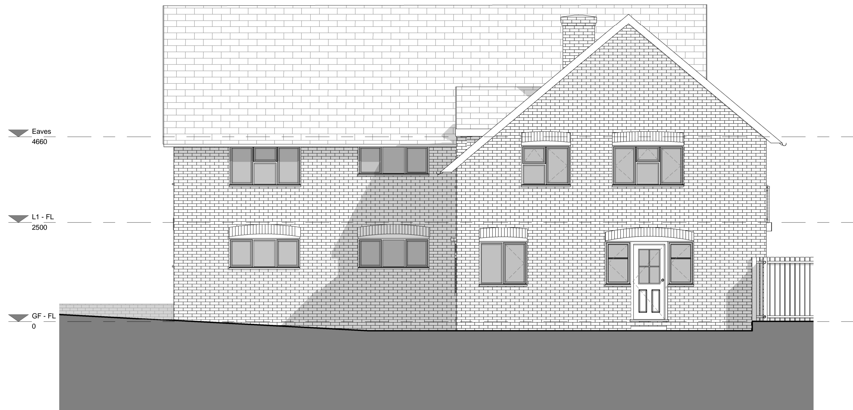
Existing East Elevation 1 : 50