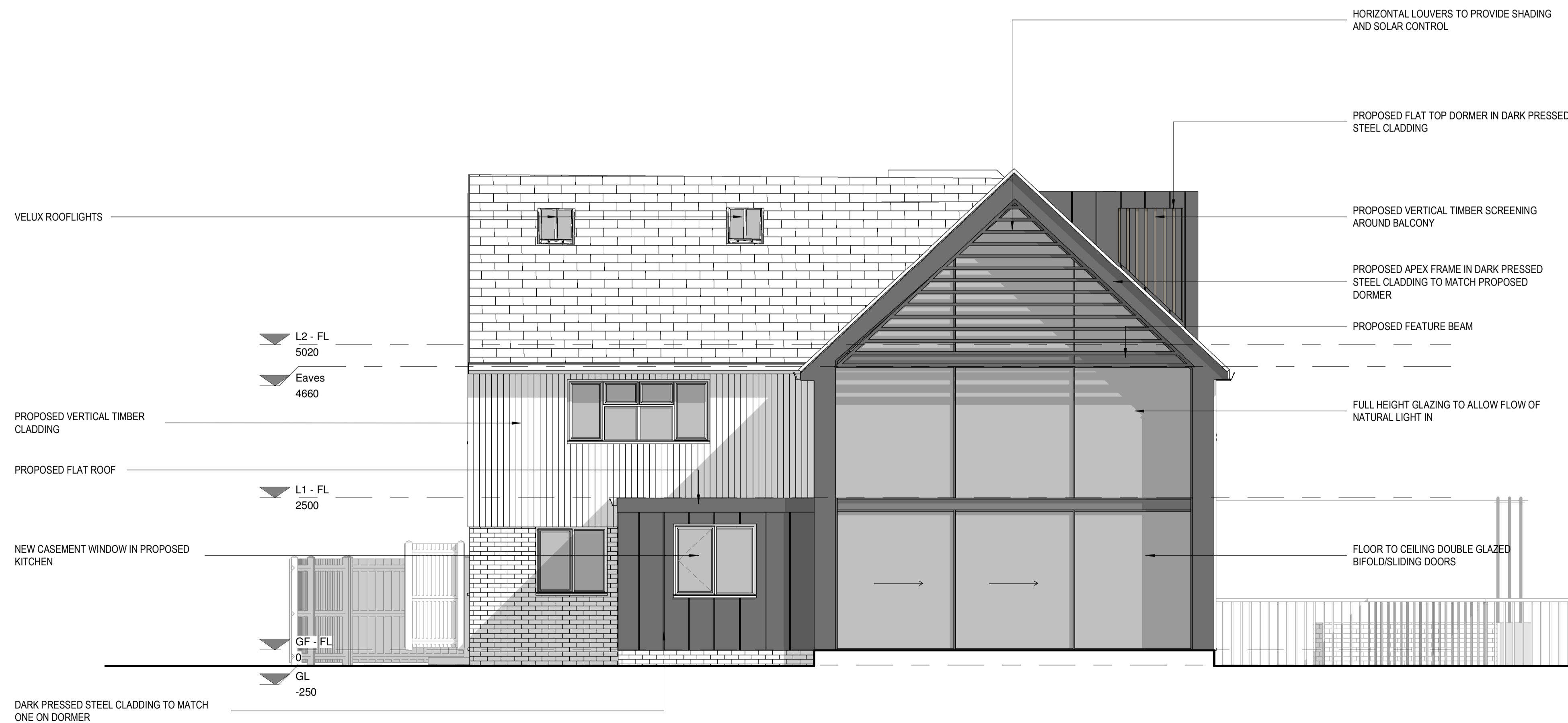
PROPOSED NORTHERN (REAR) ELEVATION 1 : 50