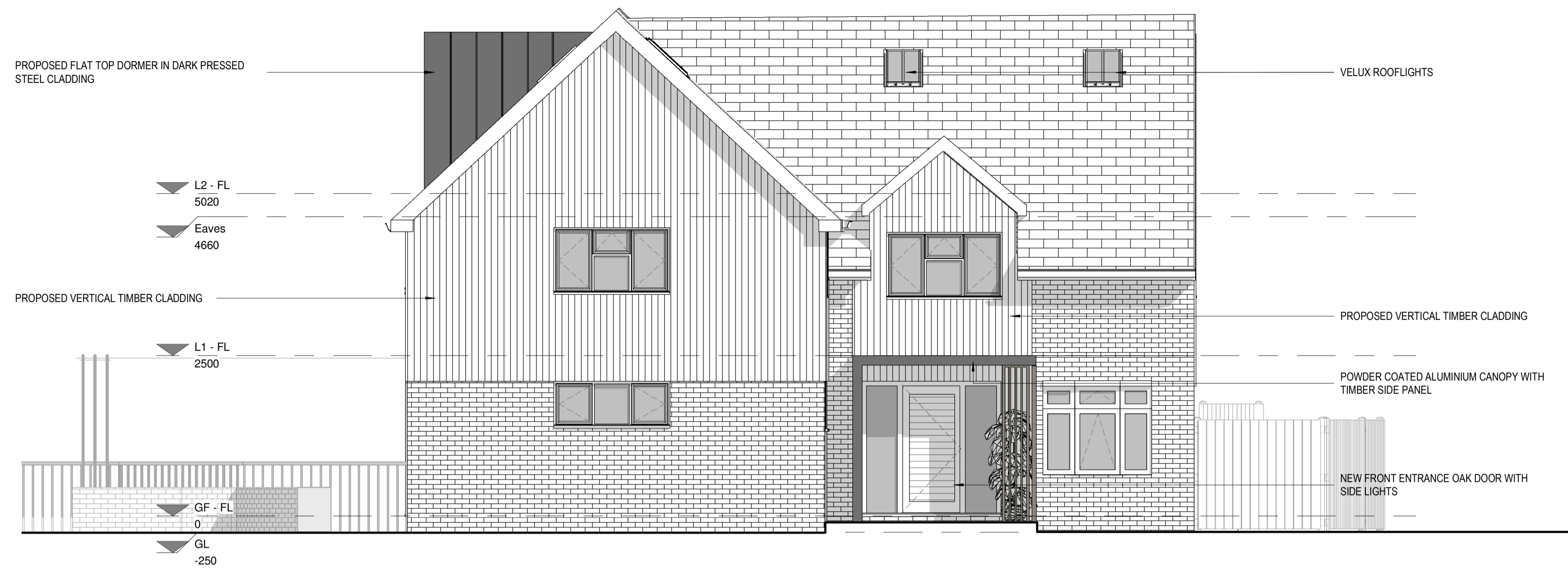
PROPOSED SOUTHERN (FRONT) ELEVATION 1 : 50