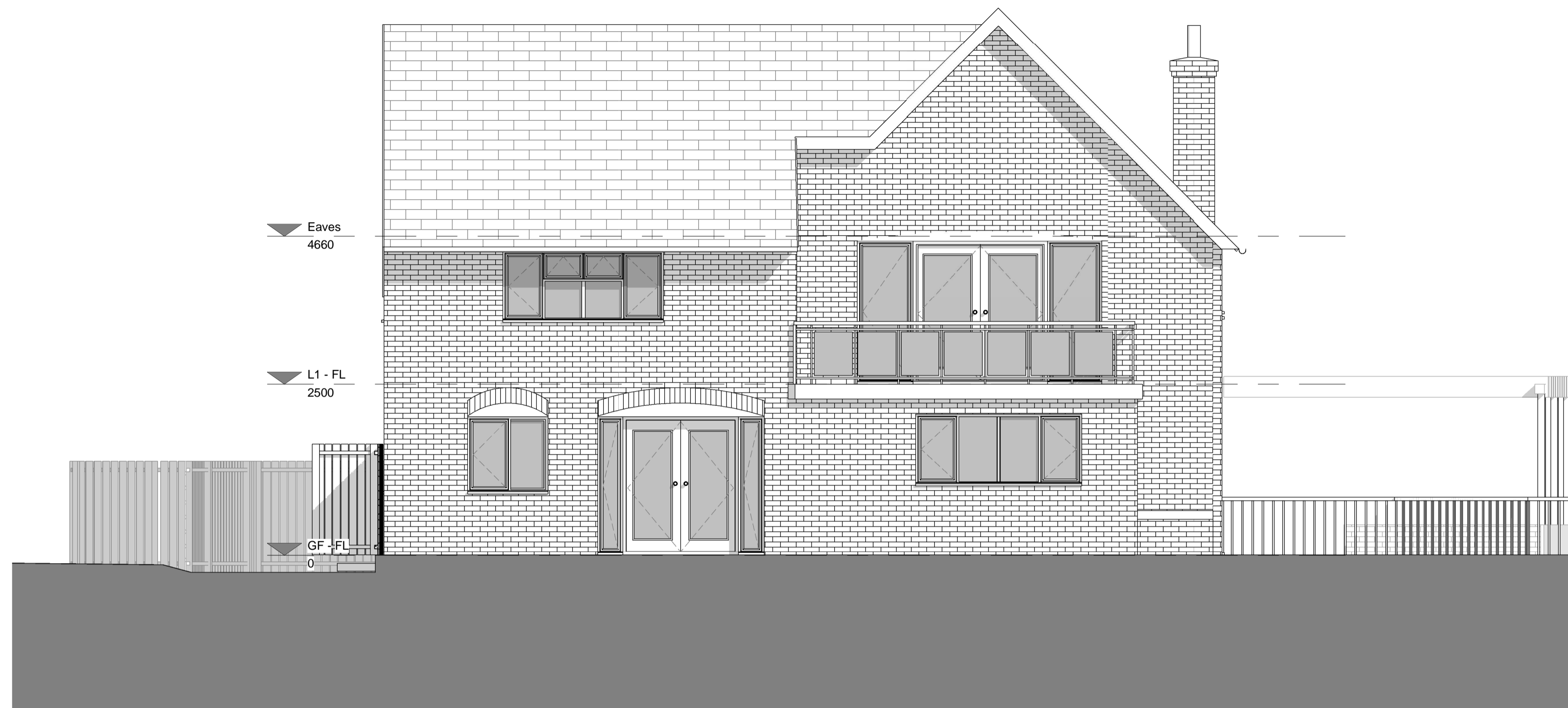
Existing North West Elevation 1 : 50