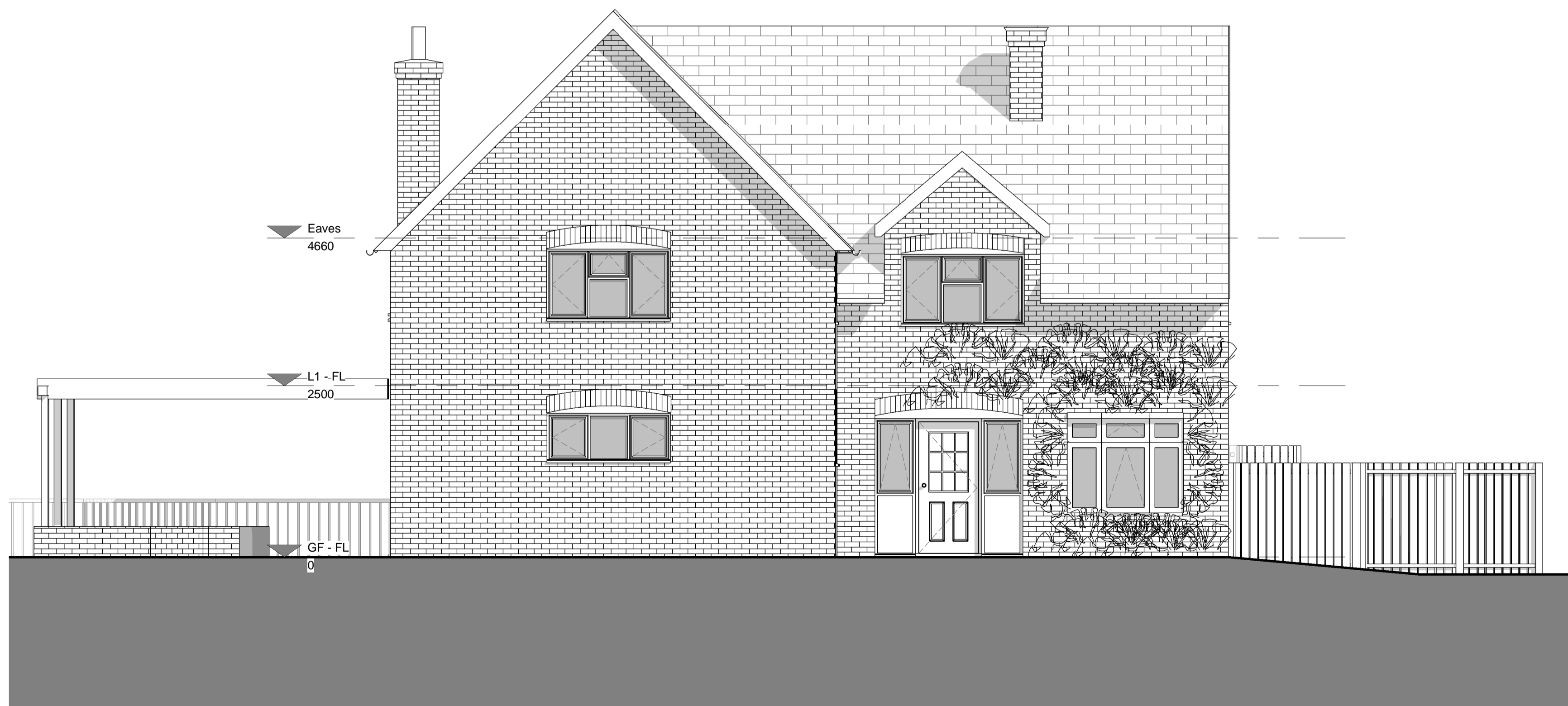
Existing South East Elevation 1 : 50