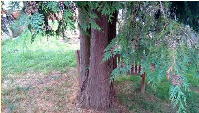
T3 - Cypress (Lawson)