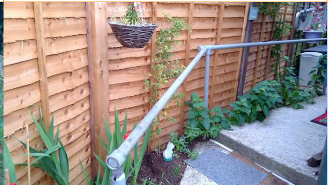
SG1 - Mixed species shrubs