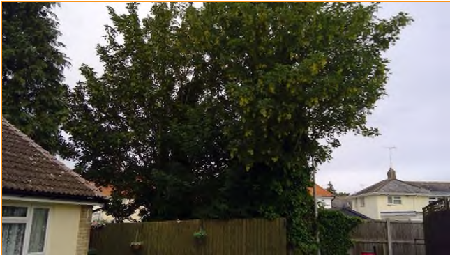
T1 - Maple