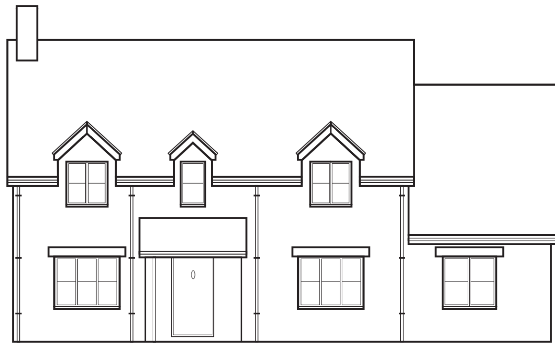
FRONT ELEVATION (SOUTH WEST)