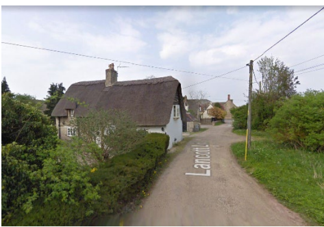
Figure 3: Google Maps – Approach from Abingdon Road along Lancott Lane