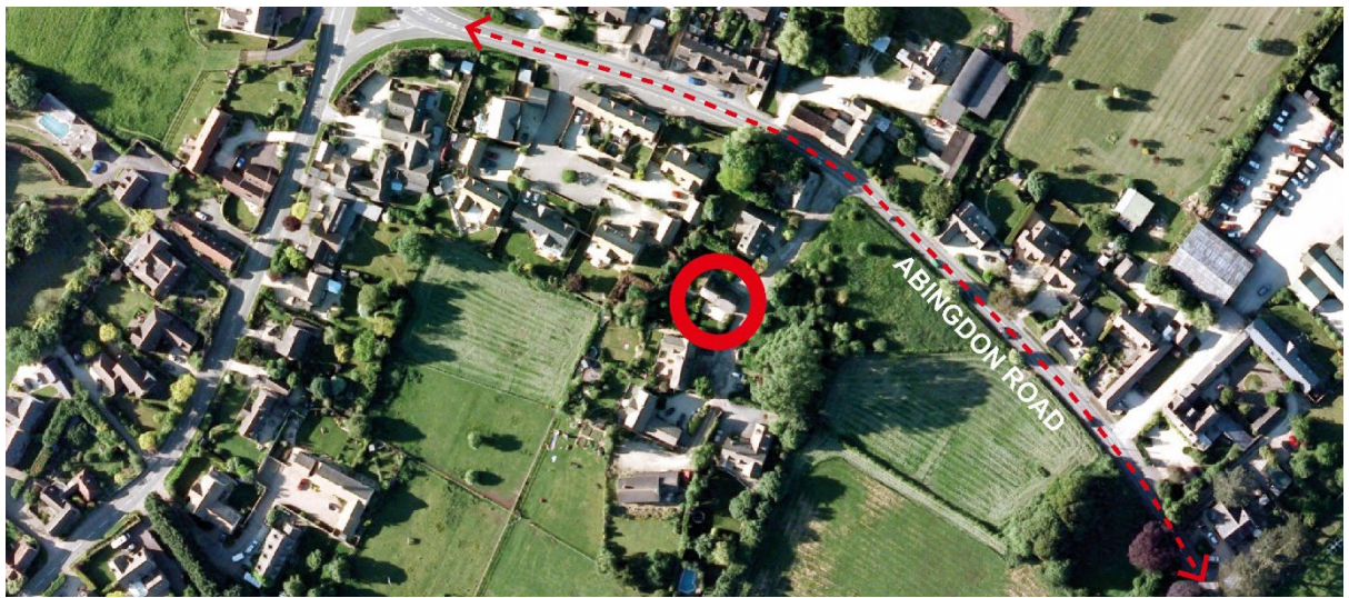
Figure 2: Google Maps - Location on Lancott Lane