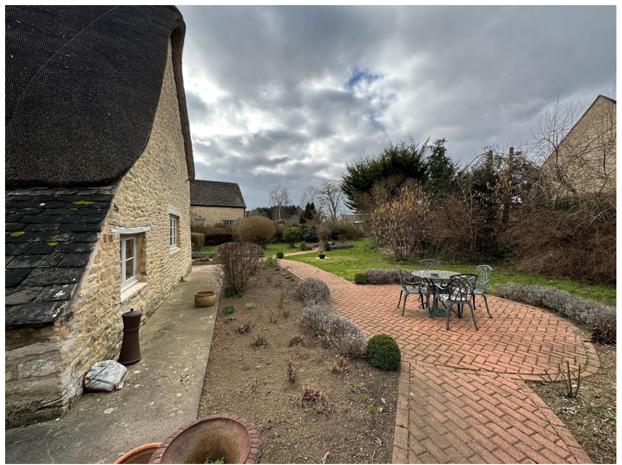
Figure 5: Rear Garden (pre-development)

t. 0113 880 5500 e. info@thehayassociates.co.uk w. www.thehayassociates.co.uk