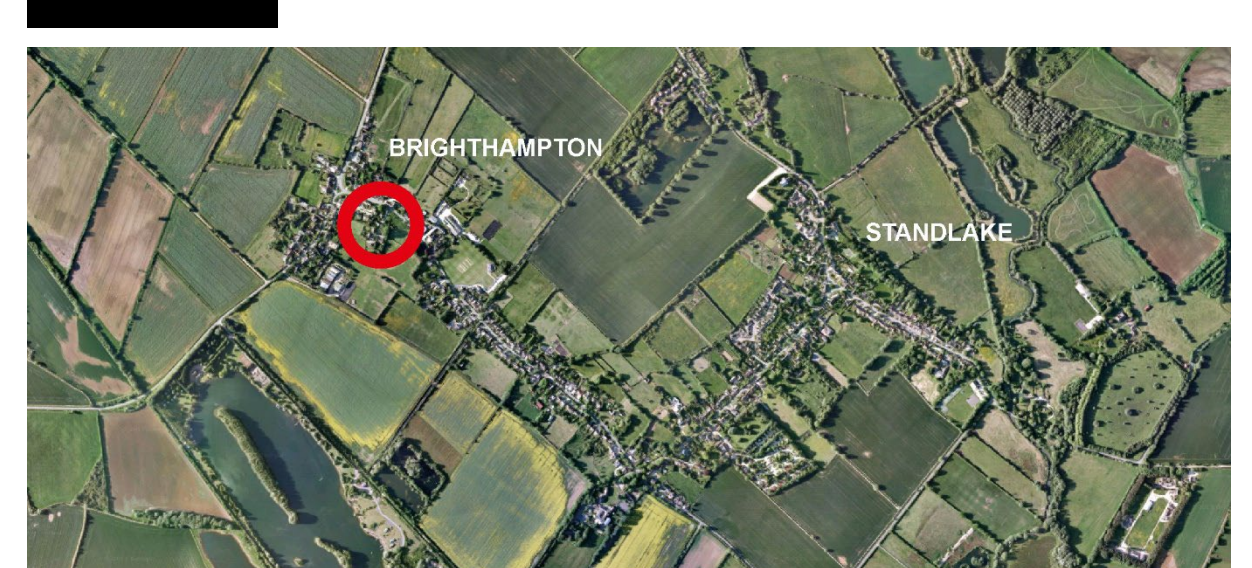
Figure 1: Google Maps - Location in relation to Brighthampton and Standlake.