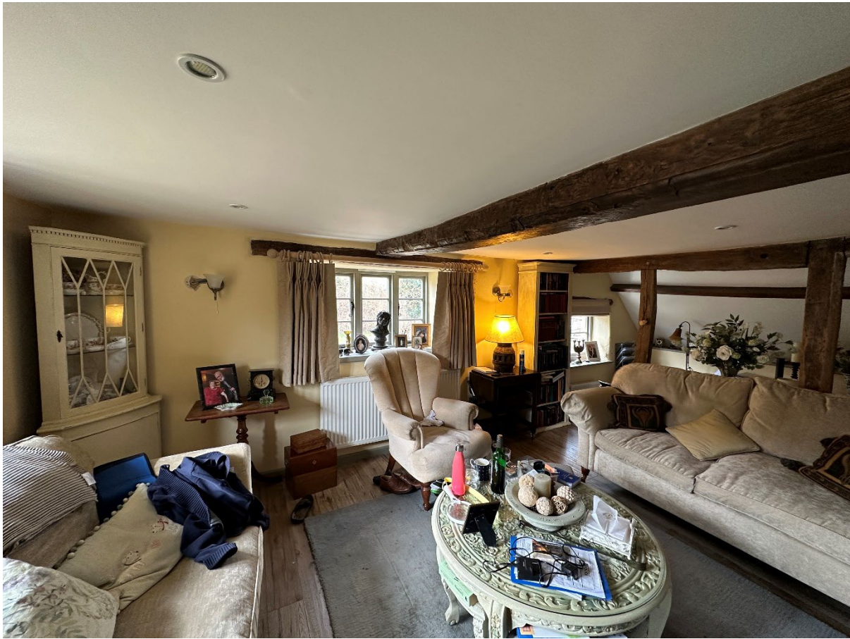
Figure 4: Interior living space (pre-development)