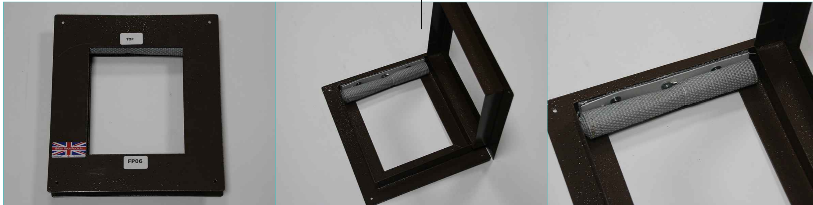
Photos from manufacturer of product proposed to be used as bat flap within standard bespoke fire stopping door.

Envirograf Fire Door Animal Flap (Product 118, reference BATFLAP1)