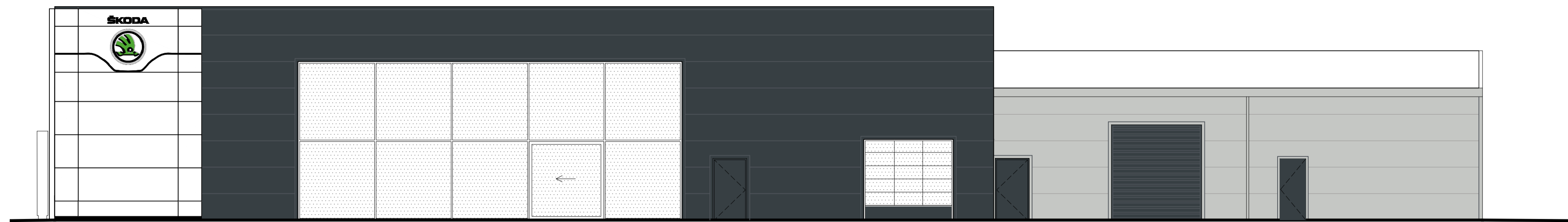
EXISTING WEST ELEVATION SCALE 1:100

Notes 1. This document and its design content is copyright © by SDA. 2. This document and its design is the property of SDA and is not to be used, copied, communicated or disclosed, in whole or in part, except in accordance with a contract, license or agreement in writing with SDA. 3. The document shall be read in conjunction with all other associated project information including models, specifications, schedules, risk assessments, related consultant & client documents. 4. All dimensions are in millimeters unless noted otherwise. 5. All dimensions to be checked on site. 6. SDA prefer to document dimensions, even though a scale bar may be present, please call us to establish correct dimensions if they are not shown. 7. Immediately report any discrepancies, errors or omissions to SDA. If in doubt, please contact SDA.