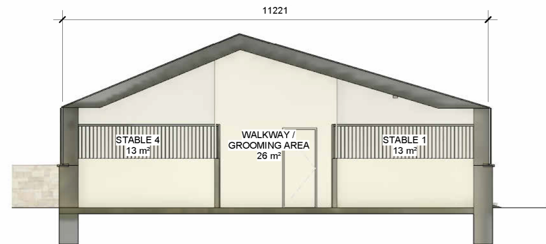
3 Stables - Short Section A 1 : 100