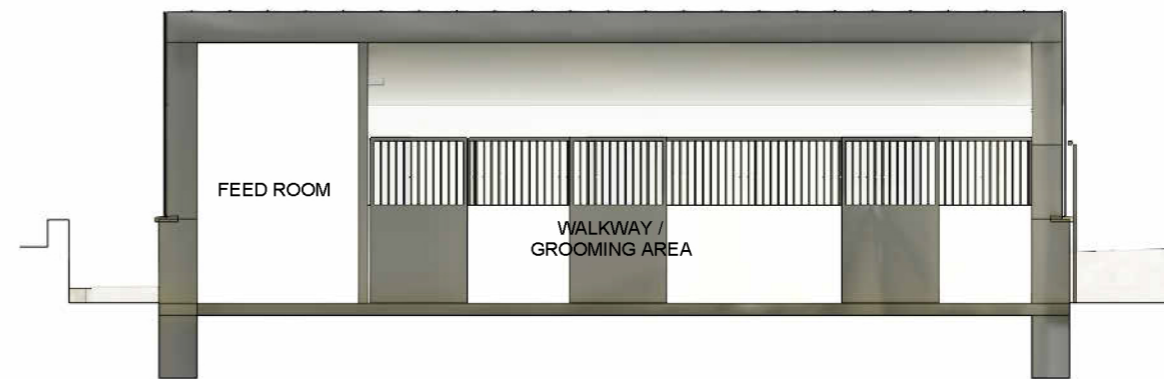
2 Stables - Long Section B 1 : 100