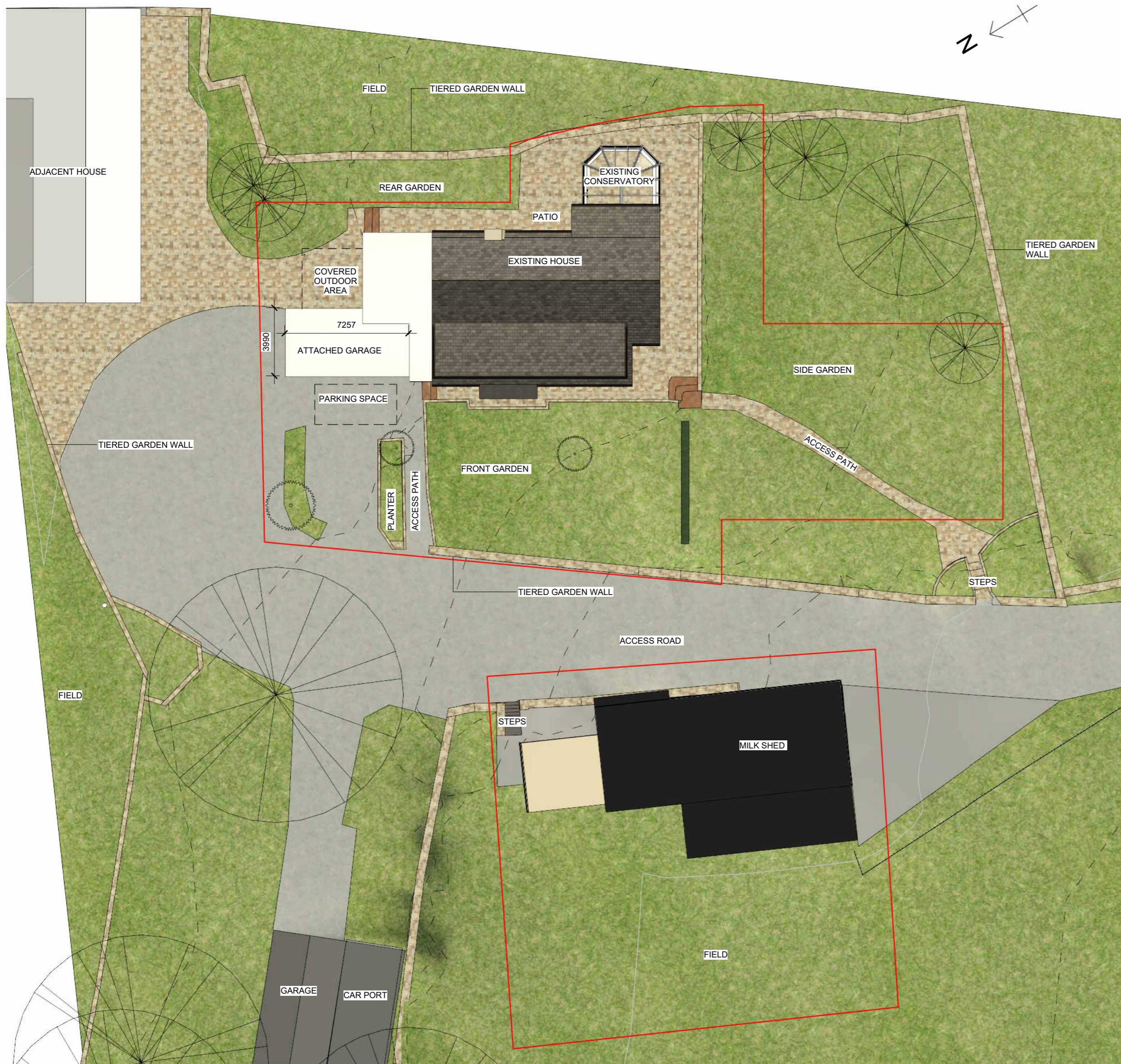
1 Existing - Site Plan 1 : 200