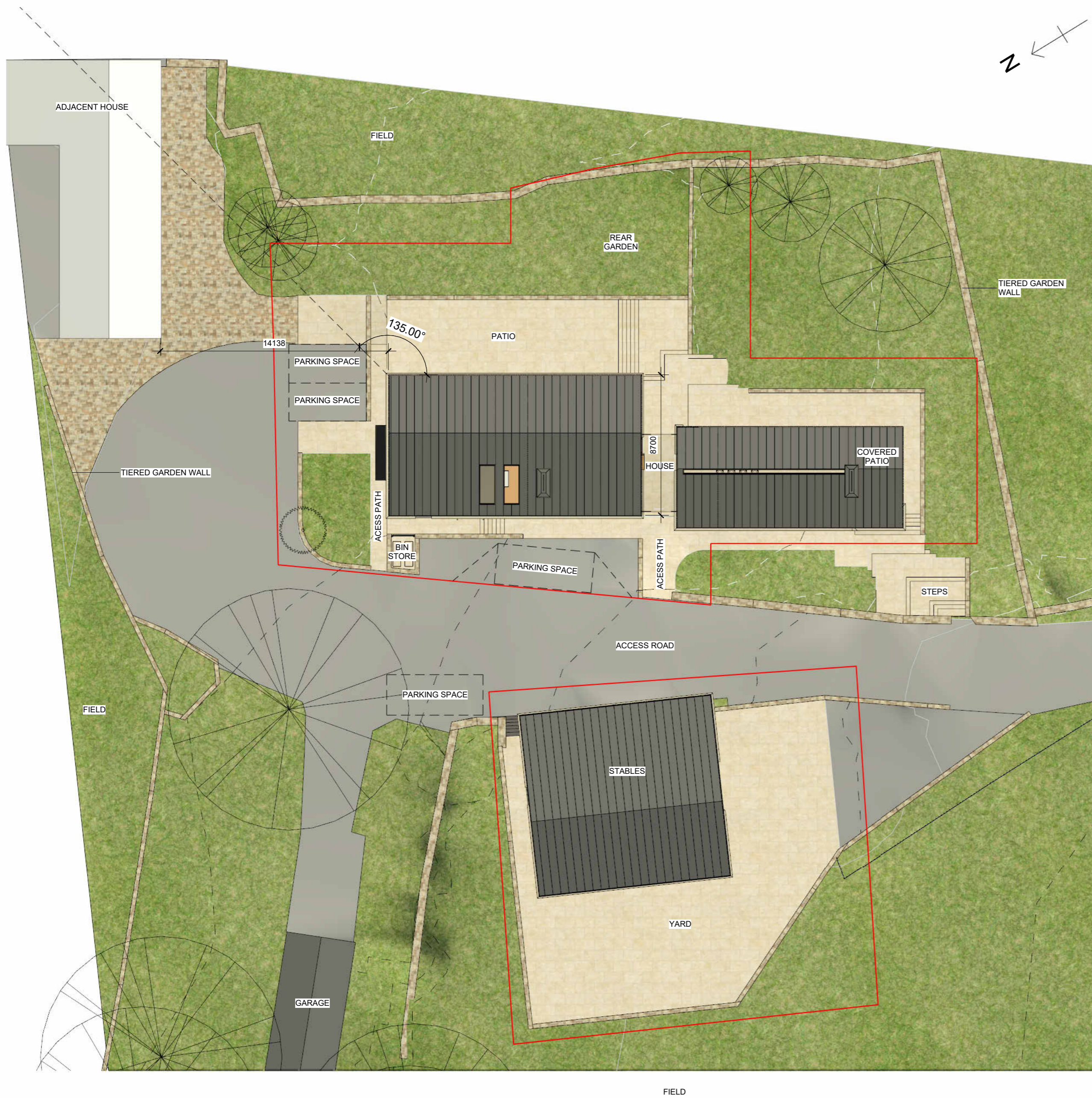
1 Proposed - Site Plan 1 : 200