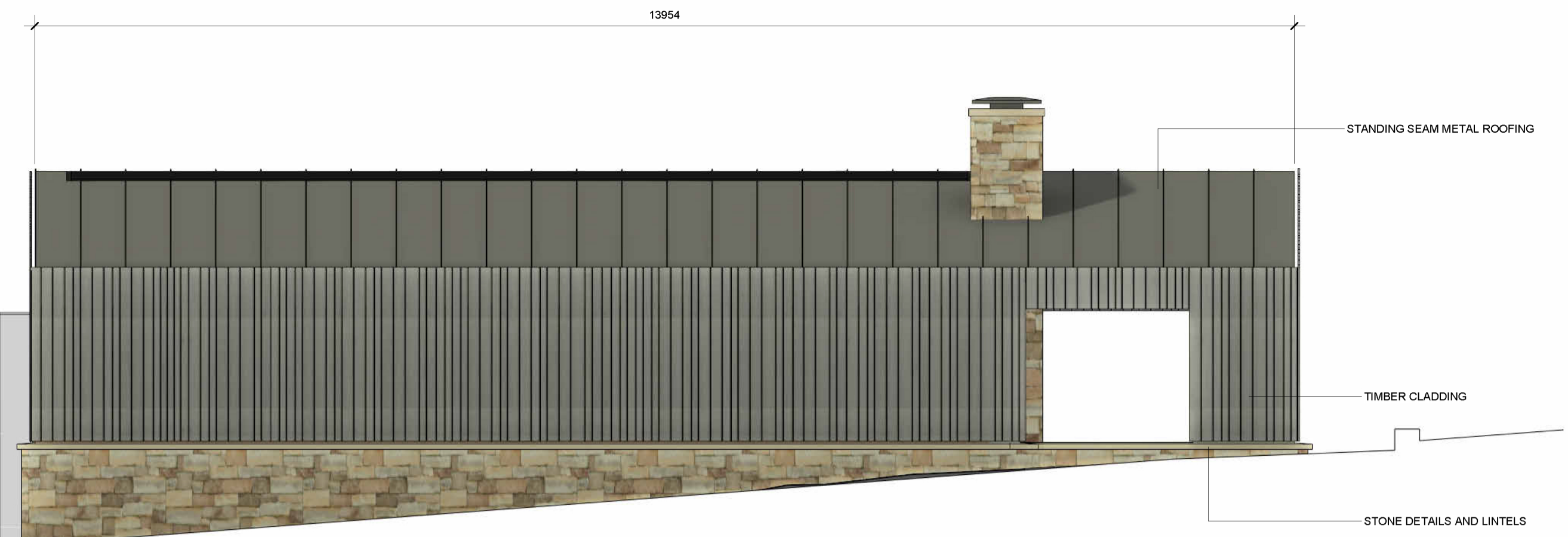
1 Proposed - West Elevation 1 : 50