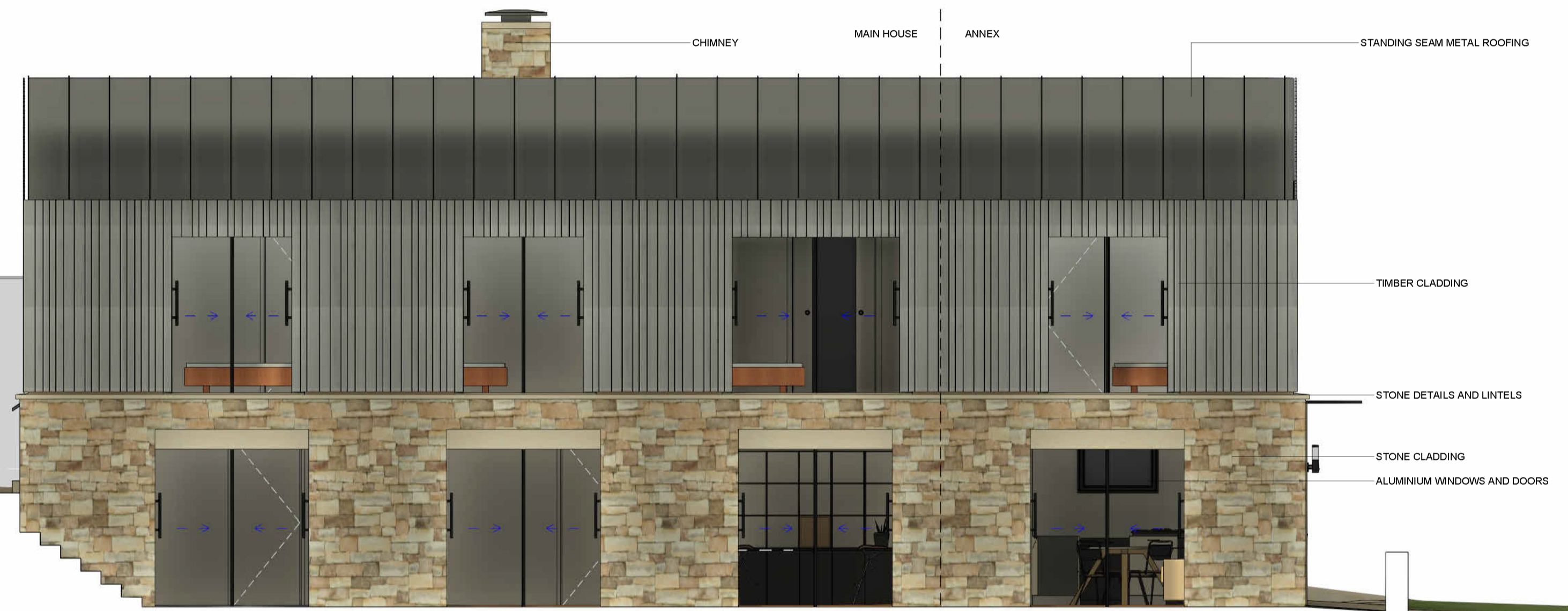
2 Proposed - East Elevation 1 : 50