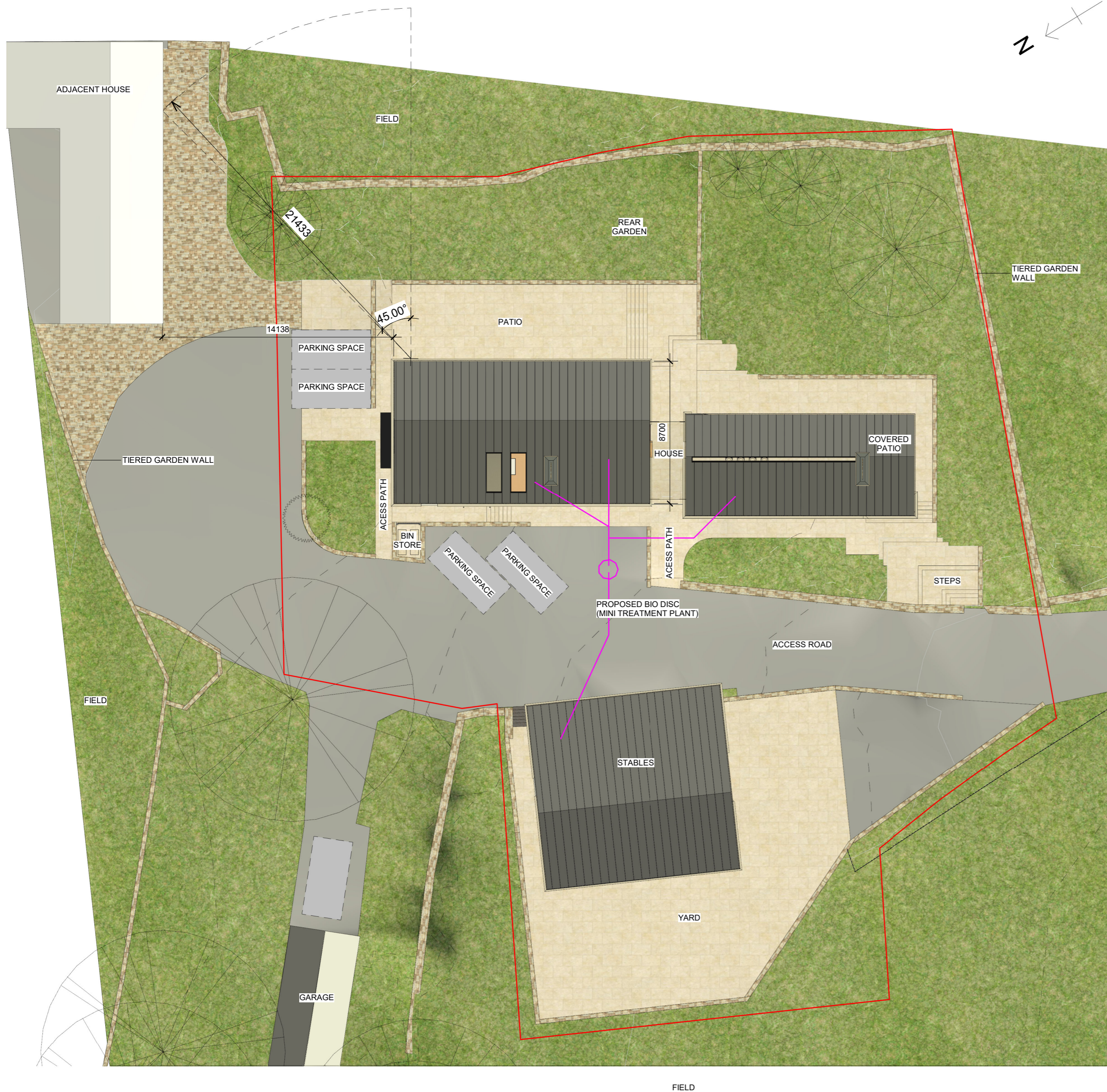
1 Proposed - Site Plan 1 : 200