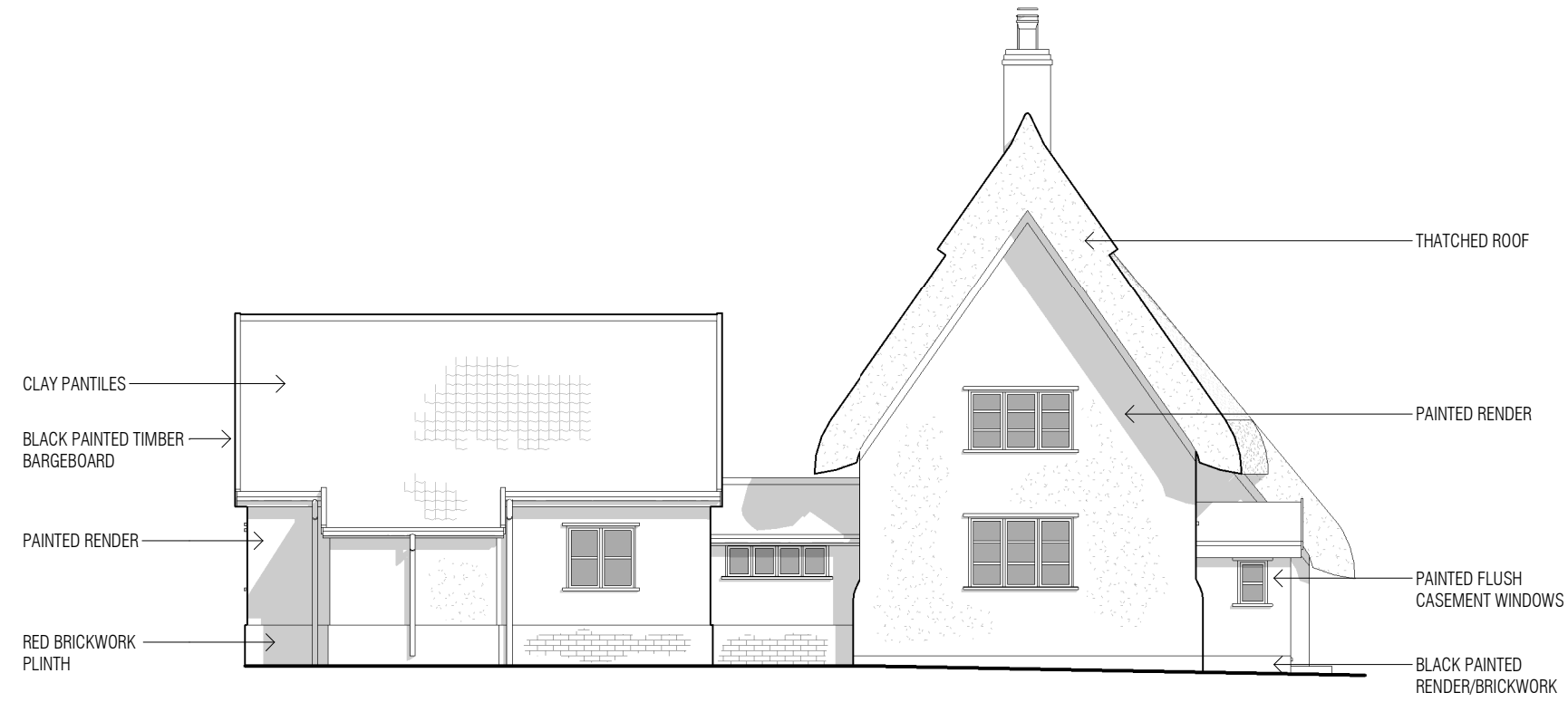
3 EXISTING EAST ELEVATION 1:100