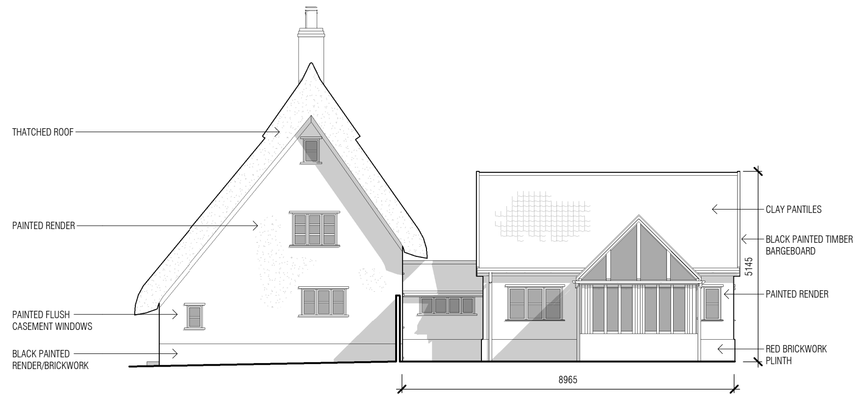
1 EXISTING WEST ELEVATION 1:100