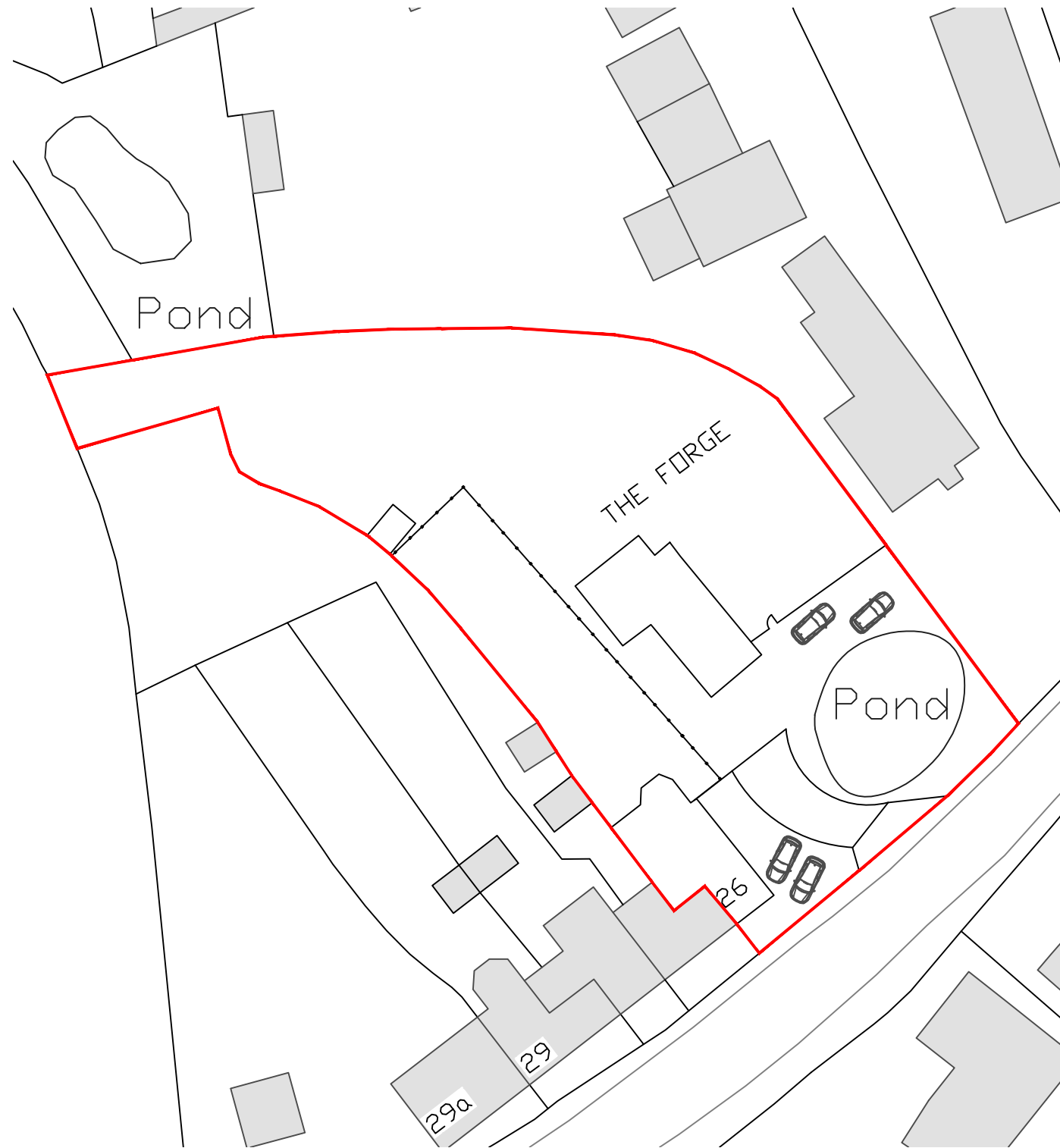
Block Plan (Proposed) Scale 1:500