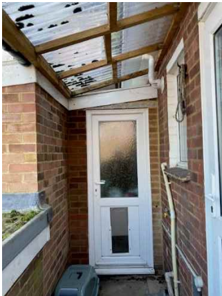
9. Side access