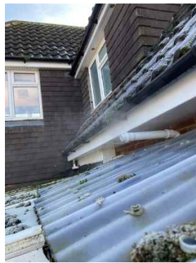
4. Under eave soffit