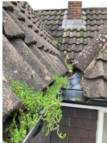
7. Roof valley