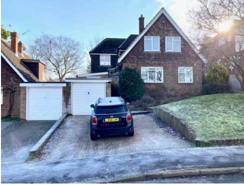
1. Front view from road

Photographic references in support of proposed twin bathroom extension