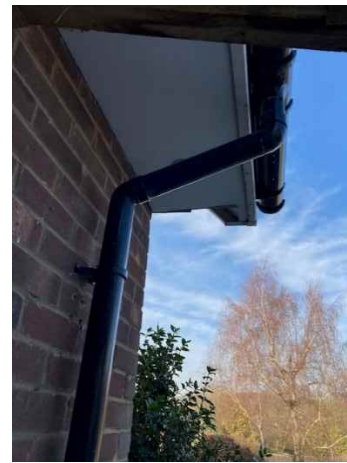
8. Main roof eave soffit