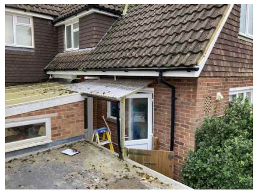
5. Kitchen door & rainwater downpipe