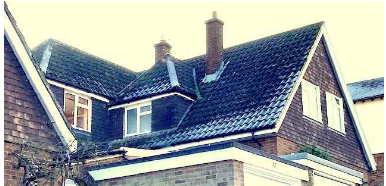
2. Existing Bathroom Dormer above Workshop & Garage