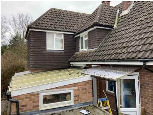
3. Upper level over workshop roof