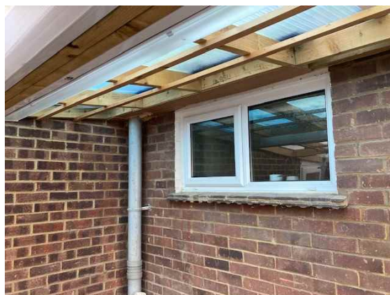
10. Workshop & bathroom soil downpipe