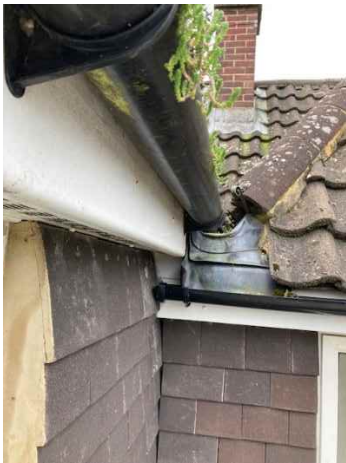
6. Eave soffits & valley