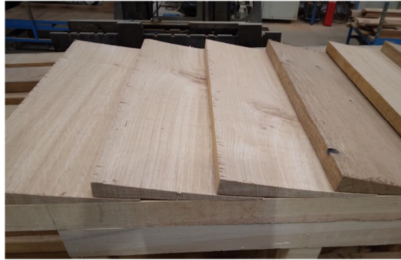
Natural timber featheredge horizontal cladding or similar