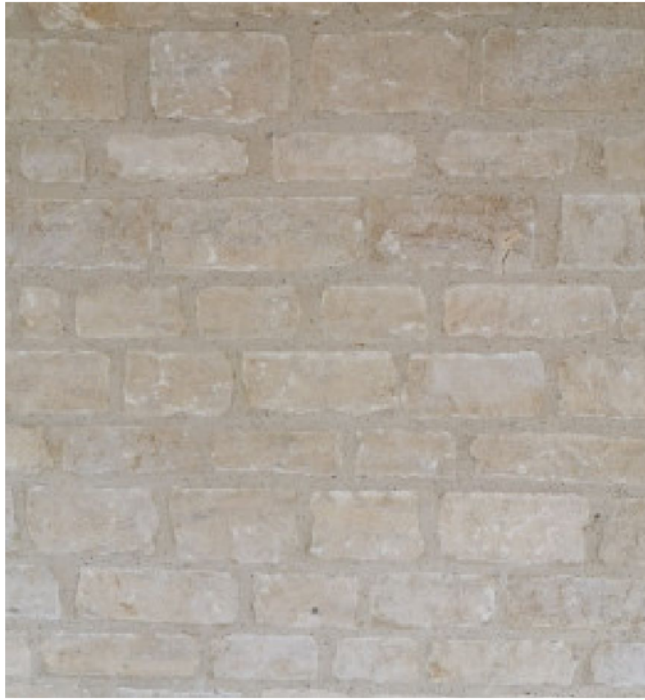
Local Cotswold Stone