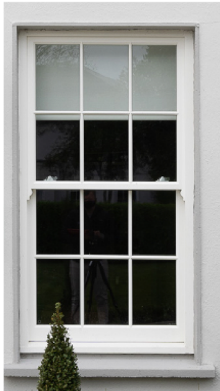
High quality painted timber sash windows with sash horns. Slimline / conservation double glazing