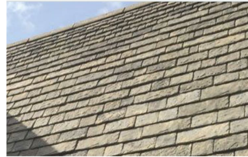
High Quality Heritage Reproduction Stone Conservation Slate