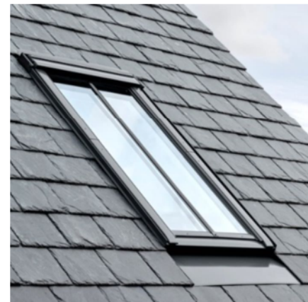
VELUX conservation style rooflight (recessed) Double glazed