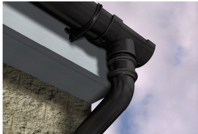
Alutec Traditional Half Round Heritage Black aluminium rainwater goods or similar