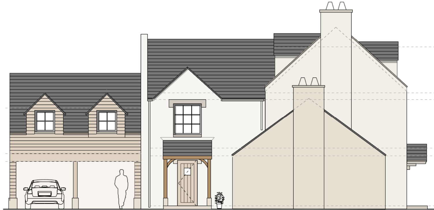
3 proposed side elevation (facing within plot)

Note: Proposed Elevations as per Plot 1. Plot 2 is mirrored.