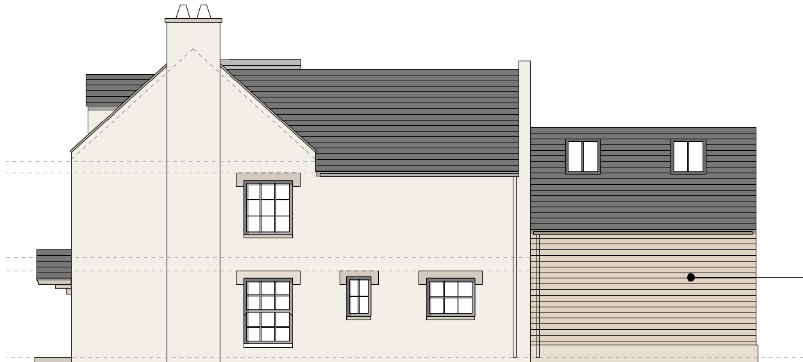
4 proposed side elevation (facing side site boundaries)