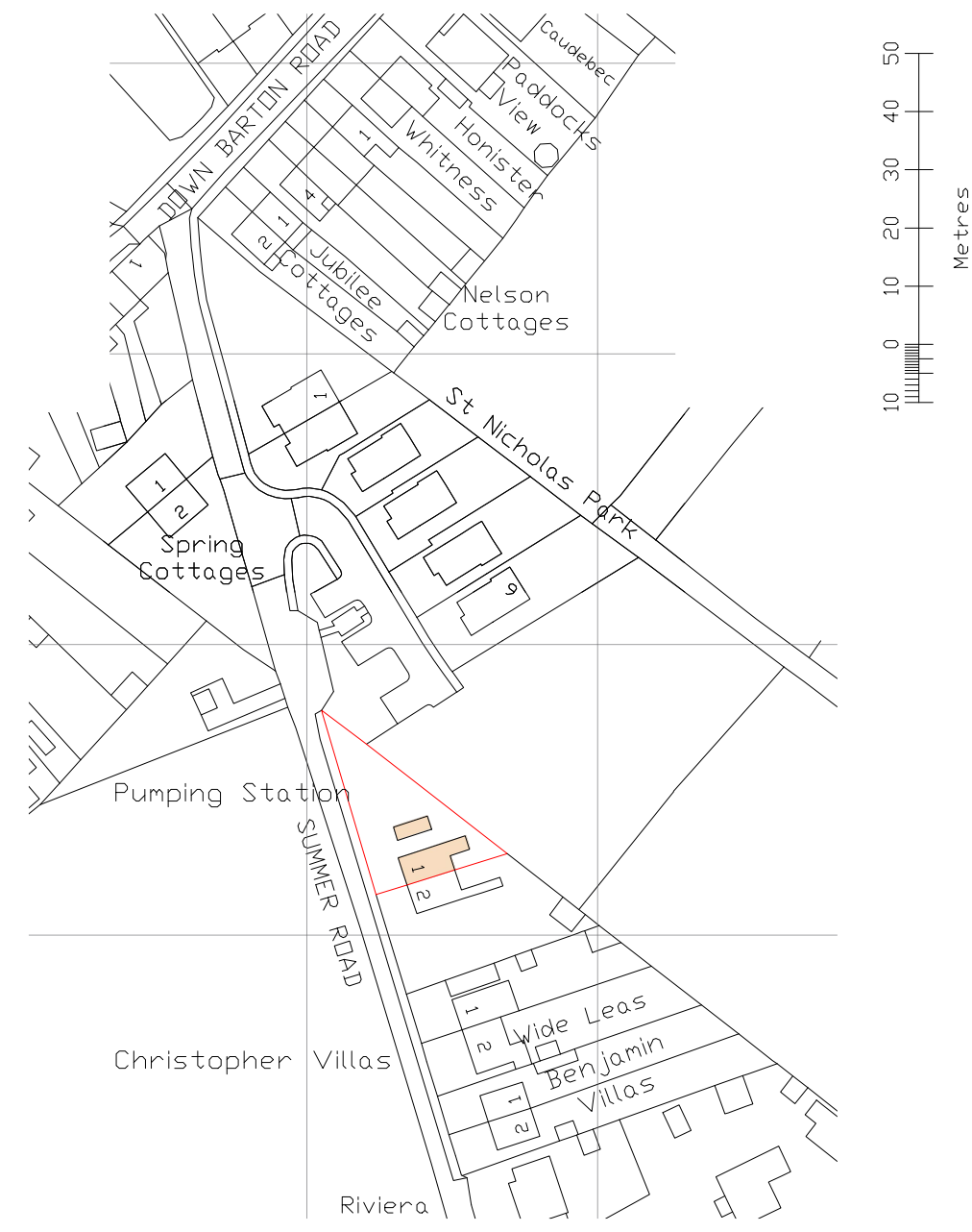
3 SITE PLAN Scale 1:1250