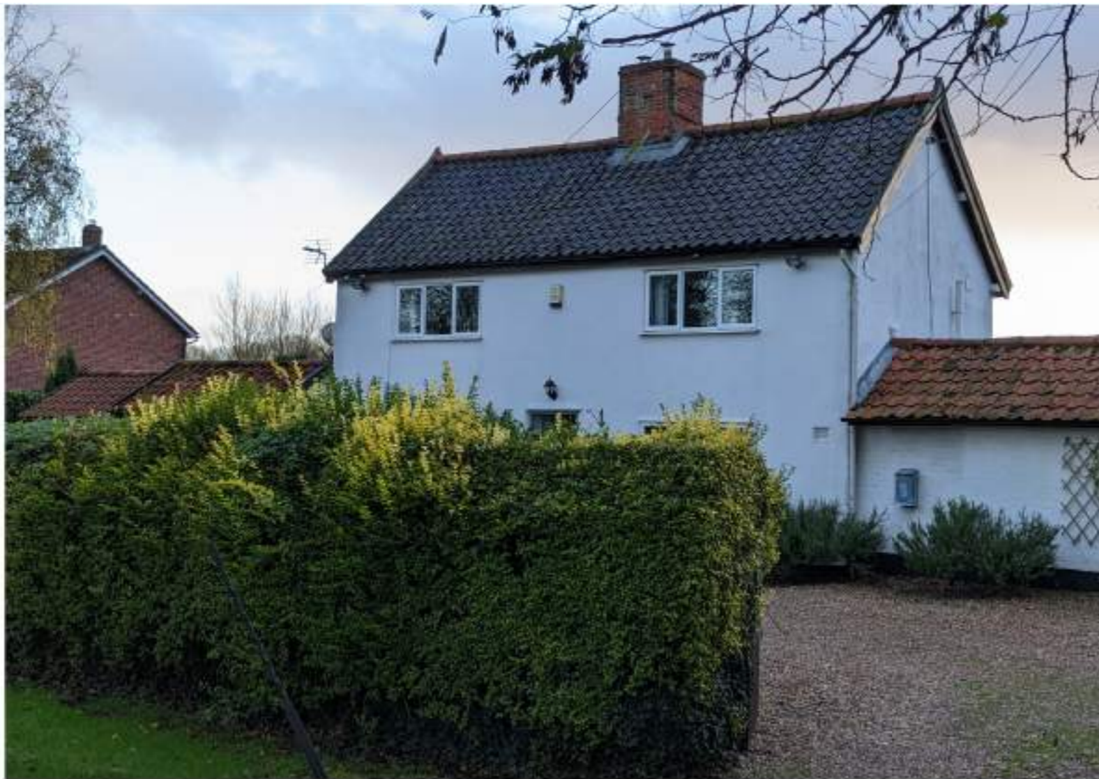
View A - from the outside of the boundary of the house