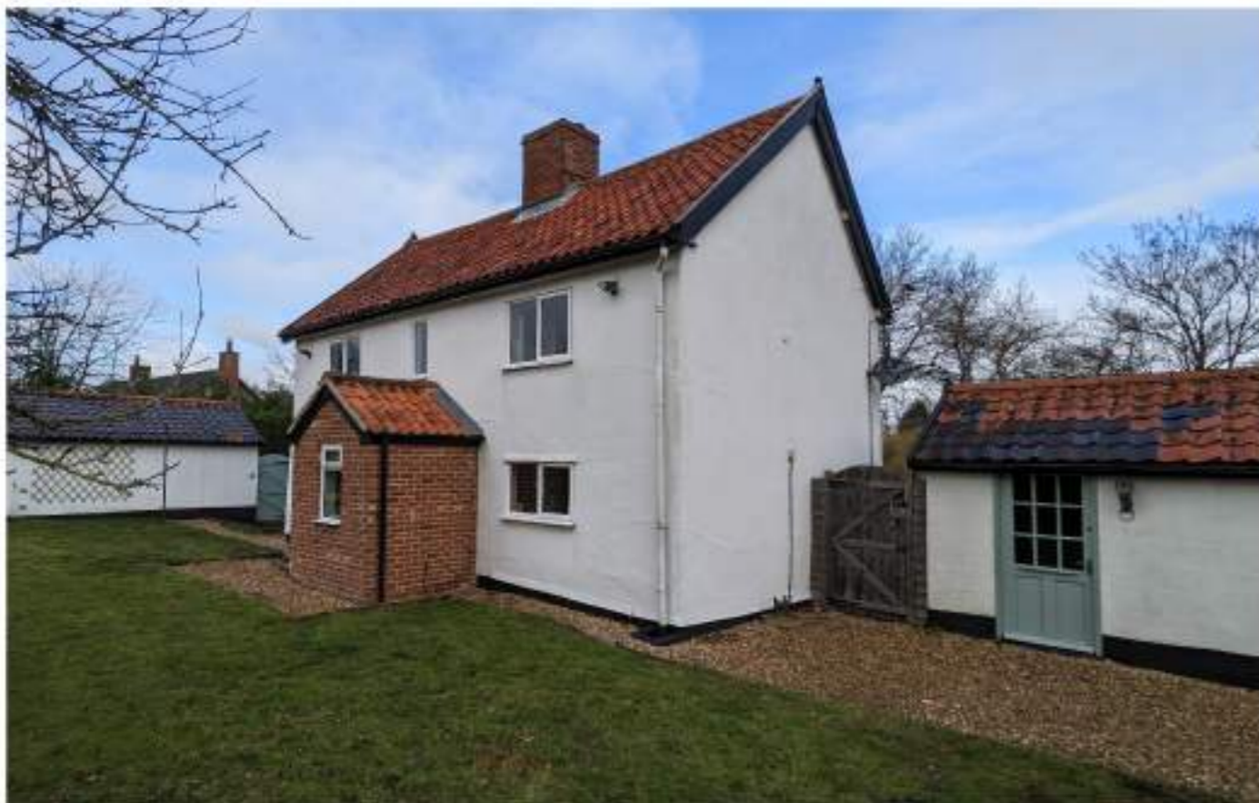
View C - from the rear garden to the house