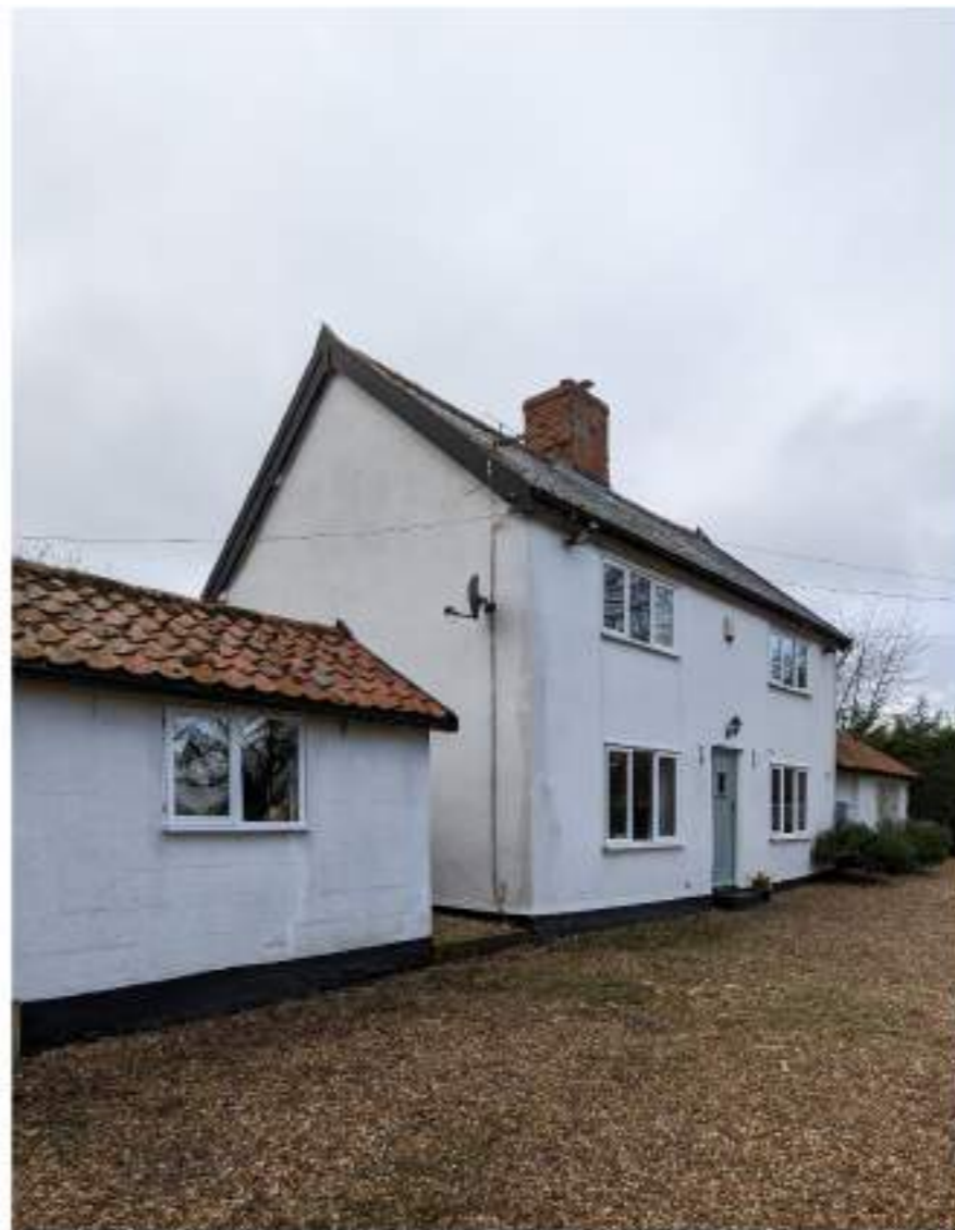
View B - from the exterior, the side of the side extension.