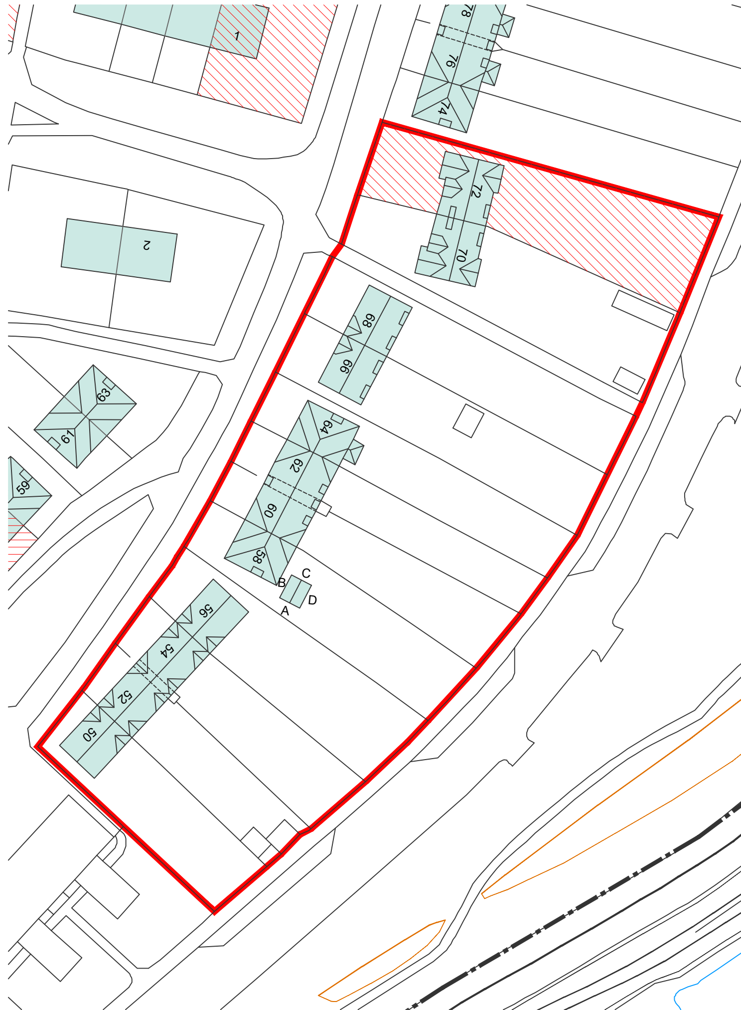
KEY PLAN 1:500

NOTES Do not scale from this drawing. Only figured dimensions are to be taken from this drawing. Contractor must verify all dimensions on site before commencing any work or shop drawings. Report any discrepancies to the architect before commencing work. If this drawing exceeds the quantities taken in any way the architects are to be informed before the work is initiated. Work within the Construction (Design & Management) Regulations 2015 is not to start until Pre Construction Health and Safety Information has been produced by the Principal Designer and a Principal Contractor has produced a Construction Phase Health and Safety Plan. This drawing is copyright and must not be reproduced without consent of BSB Architecture This drawing originates from the CAD file: S:\2022\22810_Replacement Roofs, New Earswick\010_BSB Drawings\020_Current Issue\025_Appraisal\22810_BSB_00_XX_M2_A_0070_P1_0071_P1_30-72 Chestnut Grove Outbuildings.dwg