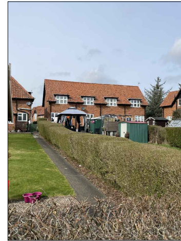
REAR ELEVATION 66 & 68 CHESTNUT GROVE ELEVATION 14