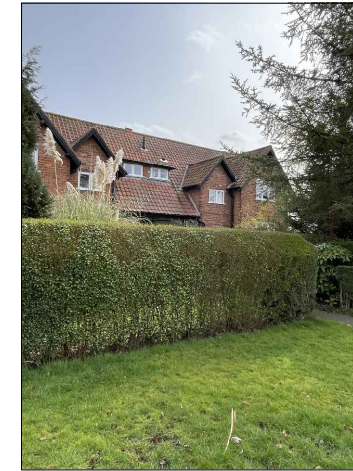
FRONT ELEVATION 70 CHESTNUT GROVE ELEVATION 17