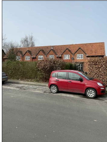
REAR ELEVATION 39 - 36 CHESTNUT GROVE ELEVATION 3