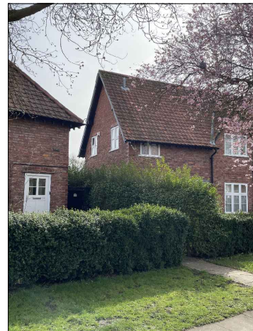
FRONT / SIDE ELEVATION 50 CHESTNUT GROVE ELEVATION 5 & 6