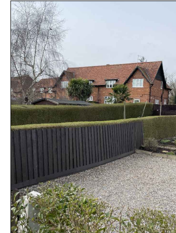
REAR / SIDE ELEVATION 70 - 72 CHESTNUT GROVE ELEVATION 18 & 20