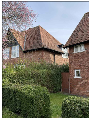
FRONT / SIDE ELEVATION 58 CHESTNUT GROVE ELEVATION 9 & 12