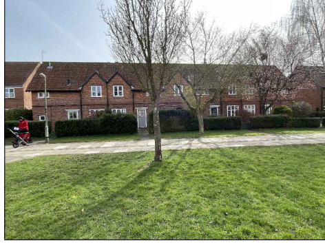
FRONT ELEVATION 36 - 30 CHESTNUT GROVE ELEVATION 1