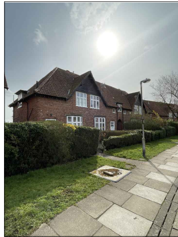
FRONT / SIDE ELEVATION 64 CHESTNUT GROVE ELEVATION 9 & 10