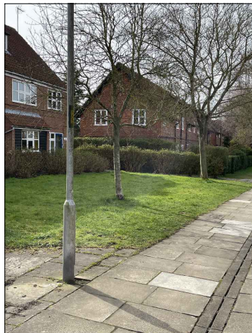
FRONT / SIDE ELEVATION 36 CHESTNUT GROVE ELEVATION 1 & 2