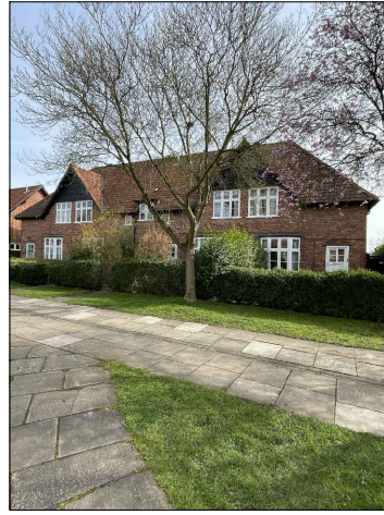
FRONT ELEVATION 64 - 58 CHESTNUT GROVE ELEVATION 9