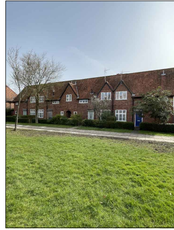
FRONT ELEVATION 56 - 50 CHESTNUT GROVE ELEVATION 5