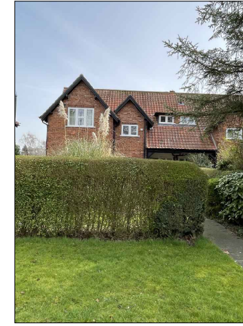
FRONT ELEVATION 72 CHESTNUT GROVE ELEVATION 17