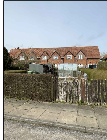
REAR ELEVATION 50 - 56 CHESTNUT GROVE ELEVATION 7