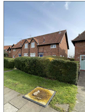
REAR ELEVATION 68 CHESTNUT GROVE ELEVATION 16