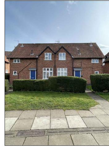
FRONT ELEVATION 68 & 66 CHESTNUT GROVE ELEVATION 13