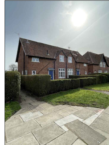
REAR ELEVATION 66 CHESTNUT GROVE ELEVATION 15