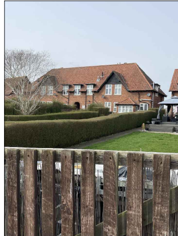
REAR ELEVATION 58 - 64 CHESTNUT GROVE ELEVATION 11