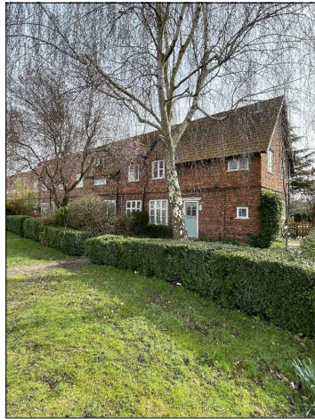
FRONT / SIDE ELEVATION 30 CHESTNUT GROVE ELEVATION 1 & 4