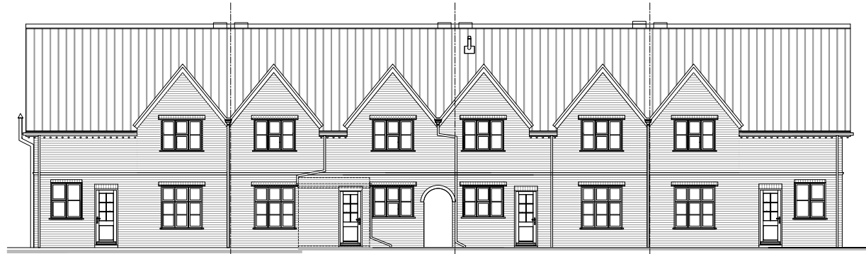
30 Chestnut Grove REAR ELEVATION ELEVATION 3