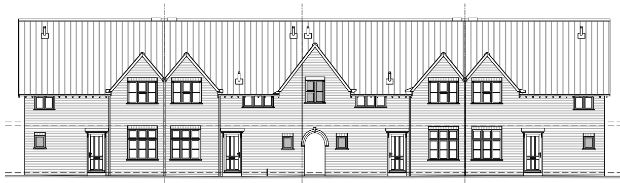
56 Chestnut Grove FRONT ELEVATION ELEVATION 5