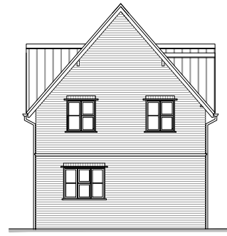
30 Chestnut Grove SIDE ELEVATION ELEVATION 4