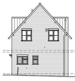
50 Chestnut Grove SIDE ELEVATION ELEVATION 8