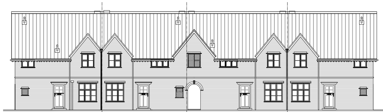
36 Chestnut Grove FRONT ELEVATION ELEVATION 1