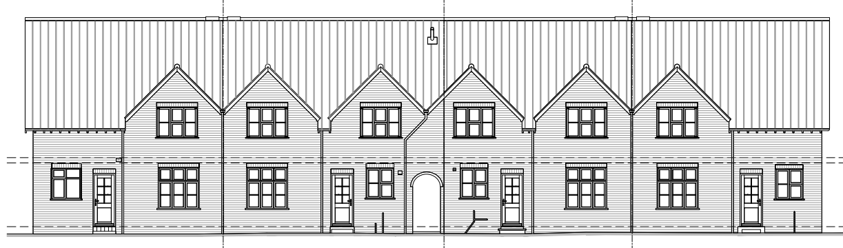
50 Chestnut Grove FRONT ELEVATION ELEVATION 7