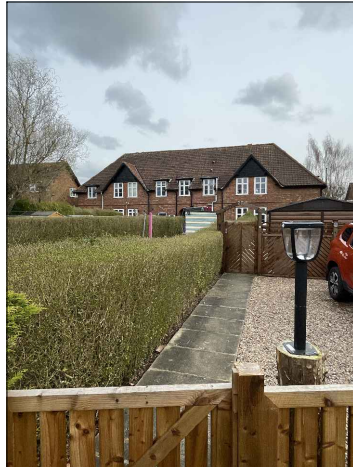
REAR ELEVATION 35 - 29 CHESTNUT GROVE ELEVATION 3