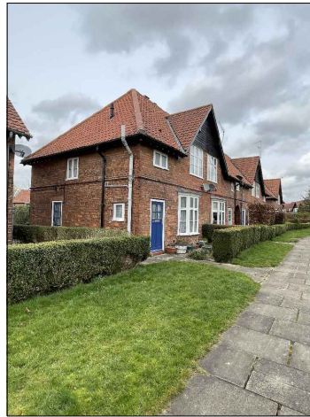
REAR / SIDE ELEVATION 53 CHESTNUT GROVE ELEVATION 9 & 10