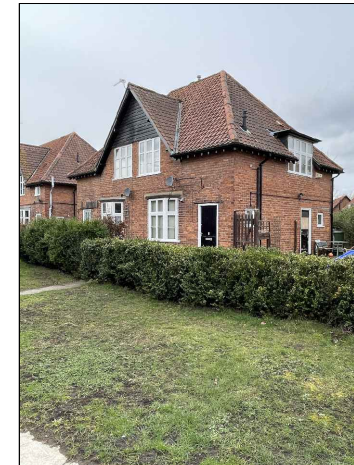
FRONT/ SIDE ELEVATION 63 CHESTNUT GROVE ELEVATION 13 & 16