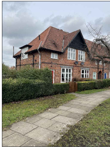
FRONT / SIDE ELEVATION 29 CHESTNUT GROVE ELEVATION 1 & 2