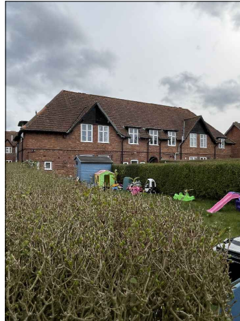
REAR ELEVATION 59 - 53 CHESTNUT GROVE ELEVATION 11