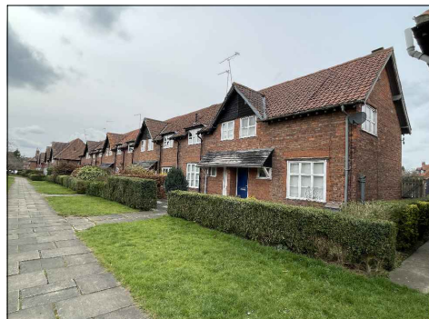
FRONT / SIDE ELEVATION 51 CHESTNUT GROVE ELEVATION 5 & 8