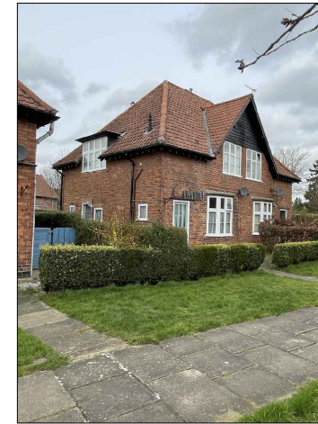
FRONT / SIDE ELEVATION 61 CHESTNUT GROVE ELEVATION 13 & 14