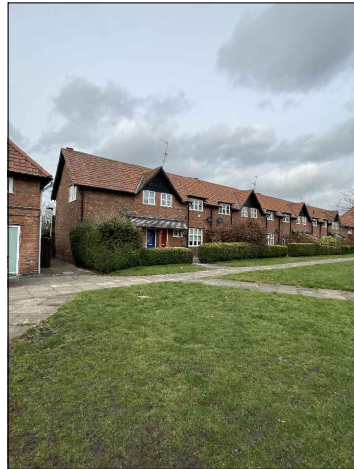
FRONT / SIDE ELEVATION 37 CHESTNUT GROVE ELEVATION 5 & 6