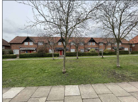
FRONT ELEVATION 37 - 51 CHESTNUT GROVE ELEVATION 5