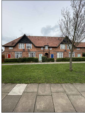
FRONT ELEVATION 29 - 35 CHESTNUT GROVE ELEVATION 1