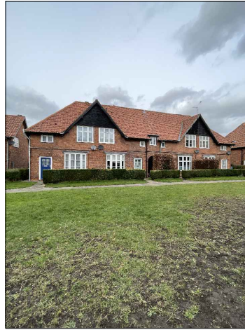
FRONT ELEVATION 53 - 59 CHESTNUT GROVE ELEVATION 9