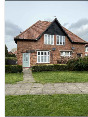
FRONT ELEVATION 61 - 63 CHESTNUT GROVE ELEVATION 13