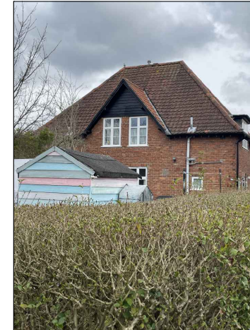
REAR ELEVATION 63 - 61 CHESTNUT GROVE ELEVATION 15