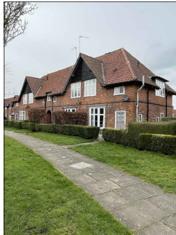
FRONT / SIDE ROOF ELEVATION 9 & 12