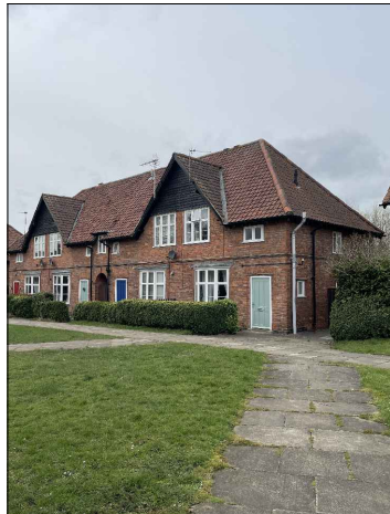
FRONT / SIDE ELEVATION 35 CHESTNUT GROVE ELEVATION 1 & 4