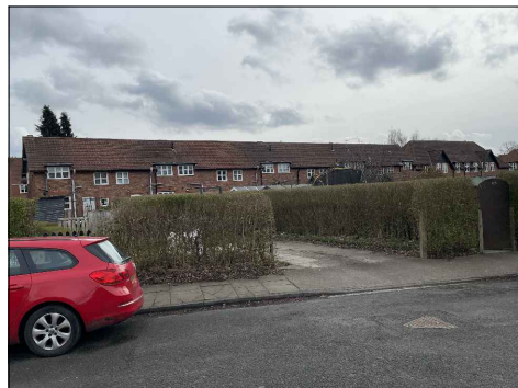
REAR ELEVATION 51 - 37 CHESTNUT GROVE ELEVATION 7