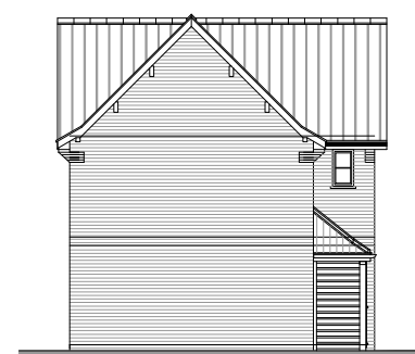
16 Ivy Place SIDE ELEVATION ELEVATION 14