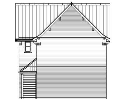
15 Ivy Place SIDE ELEVATION ELEVATION 10