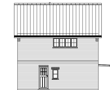
13 Ivy Place SIDE ELEVATION ELEVATION 12