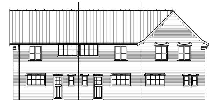
15 Ivy Place 14 Ivy Place 13 Ivy Place REAR ELEVATION ELEVATION 11