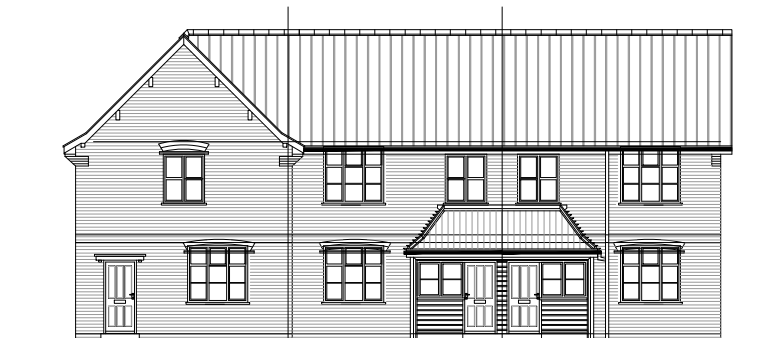
13 Ivy Place 14 Ivy Place 15 Ivy Place FRONT ELEVATION ELEVATION 9