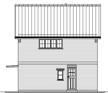
20 Ivy Place SIDE ELEVATION ELEVATION 16