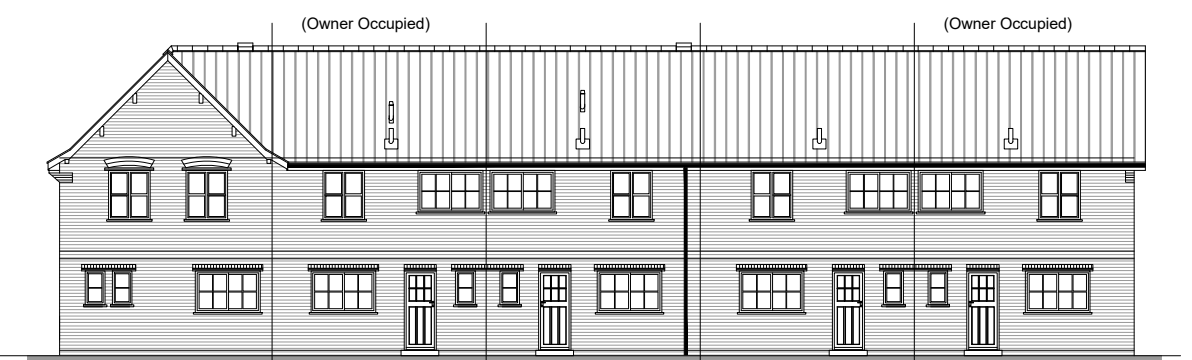
(Owner Occupied) (Owner Occupied) 20 Ivy Place 19 Ivy Place 18 Ivy Place 17 Ivy Place 16 Ivy Place REAR ELEVATION ELEVATION 15