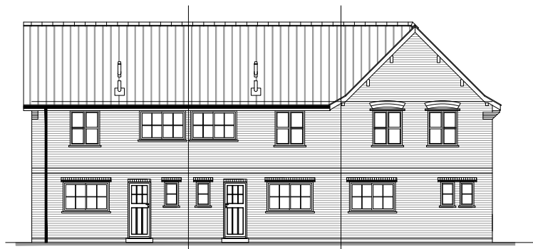
15 Ivy Place 14 Ivy Place 13 Ivy Place REAR ELEVATION ELEVATION 11