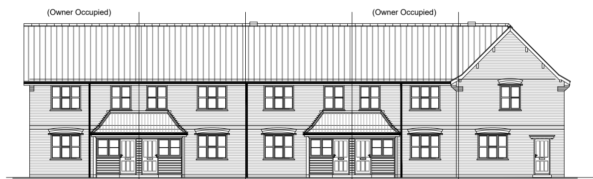
(Owner Occupied) (Owner Occupied) 16 Ivy Place 17 Ivy Place 18 Ivy Place 19 Ivy Place 20 Ivy Place FRONT ELEVATION ELEVATION 13