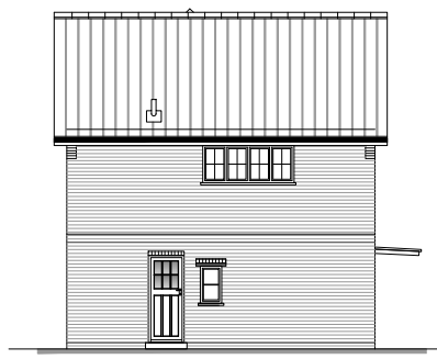
13 Ivy Place SIDE ELEVATION ELEVATION 12