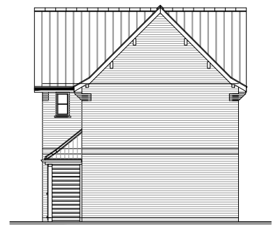
15 Ivy Place SIDE ELEVATION ELEVATION 10