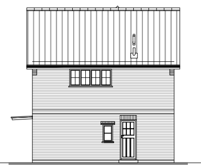
20 Ivy Place SIDE ELEVATION ELEVATION 16