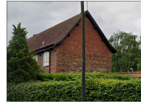
SIDE ELEVATION 16 IVY PLACE ELEVATION 14