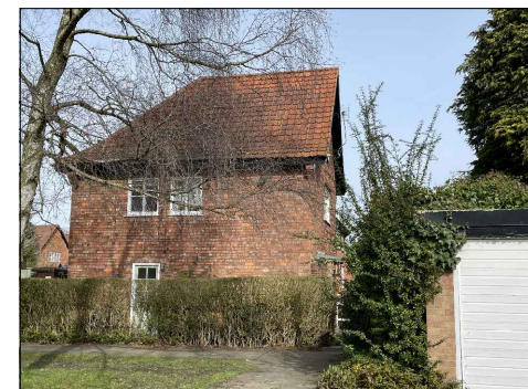
SIDE ELEVATION 1 IVY PLACE ELEVATION 4