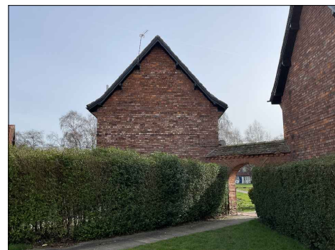
REAR ELEVATION 6 IVY PLACE ELEVATION 8