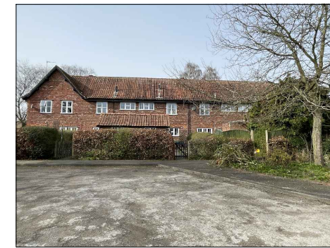
REAR ELEVATION 20 - 16 IVY PLACE ELEVATION 15