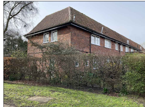
SIDE ELEVATION 12 IVY PLACE ELEVATION 6