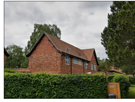
SIDE ELEVATION 13 - 15 IVY PLACE ELEVATION 10