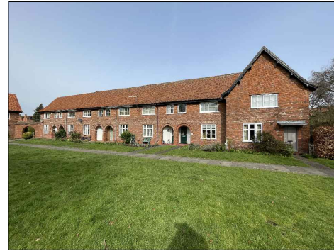
FRONT ELEVATION 6 - 12 IVY PLACE ELEVATION 5