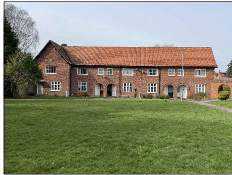
FRONT ELEVATION 1 - 5 IVY PLACE ELEVATION 1