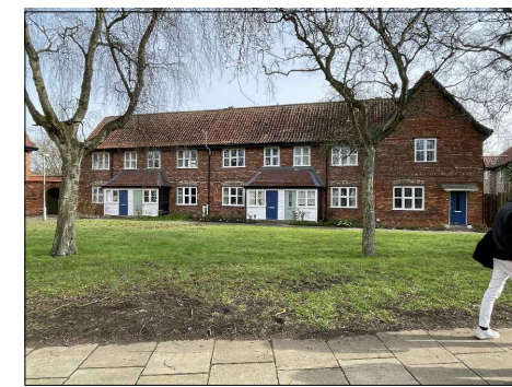
FRONT ELEVATION 16 - 20 IVY PLACE ELEVATION 13