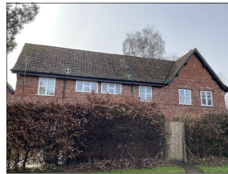
REAR ELEVATION 15 - 13 IVY PLACE ELEVATION 11