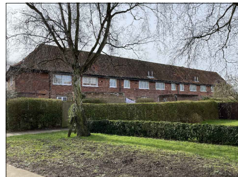
REAR ELEVATION 12 - 6 IVY PLACE ELEVATION 7