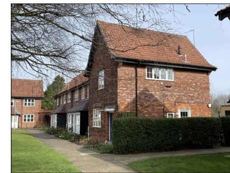
REAR ELEVATION 20 IVY PLACE ELEVATION 16