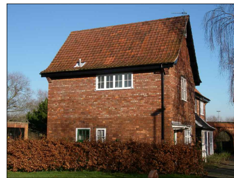
SIDE ELEVATION 13 IVY PLACE ELEVATION 12