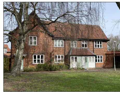
FRONT ELEVATION 13 - 15 IVY PLACE ELEVATION 9