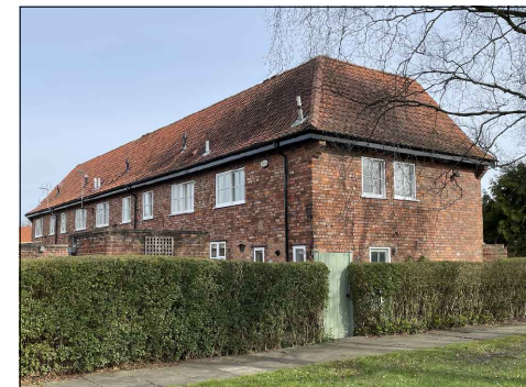
REAR ELEVATION 5 - 1 IVY PLACE ELEVATION 3