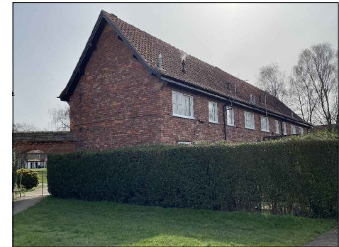
SIDE ELEVATION 5 IVY PLACE ELEVATION 2