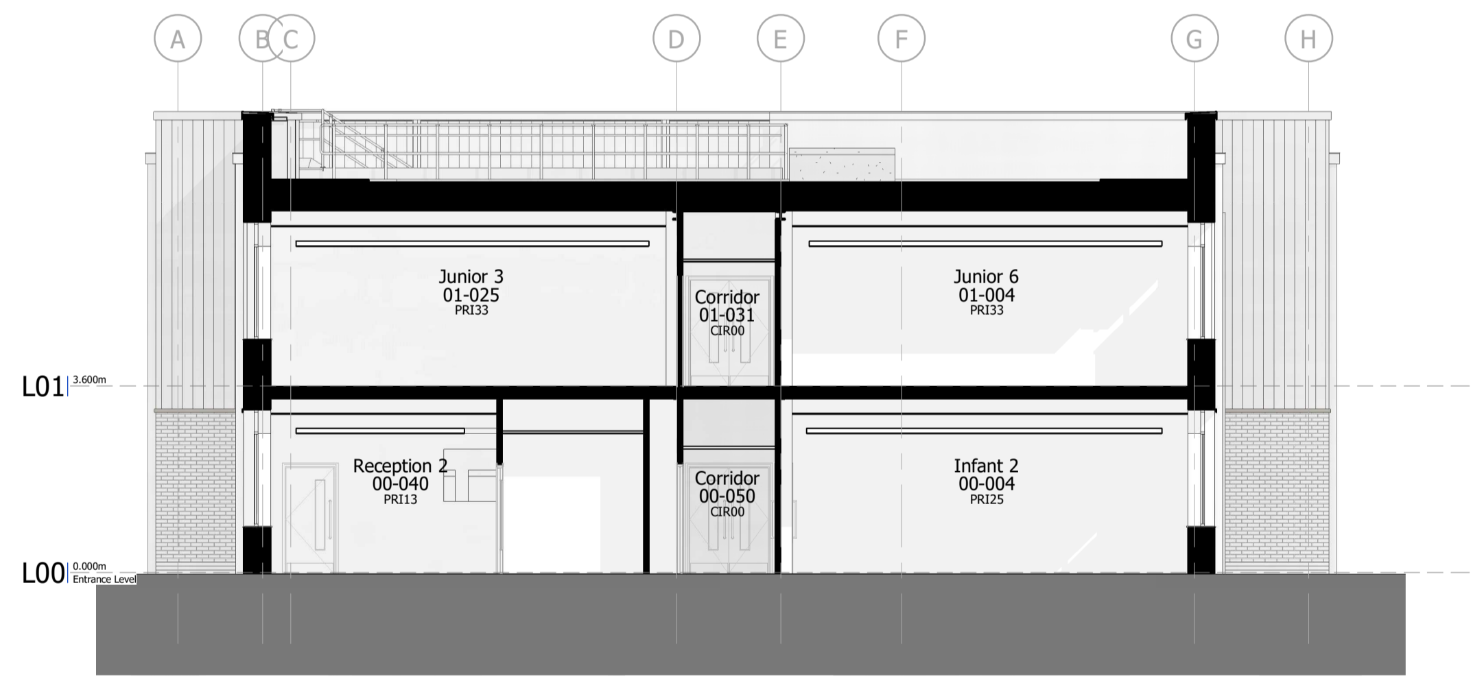
Section 3 1 : 100