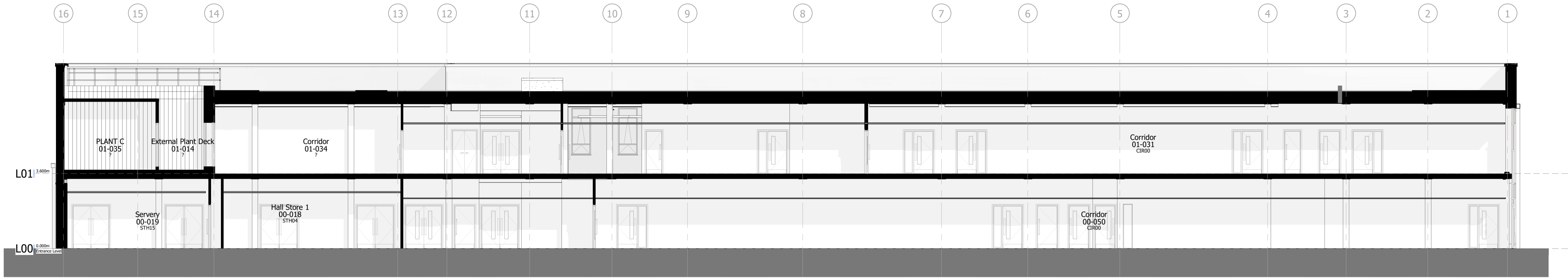
Section 1 1 : 100