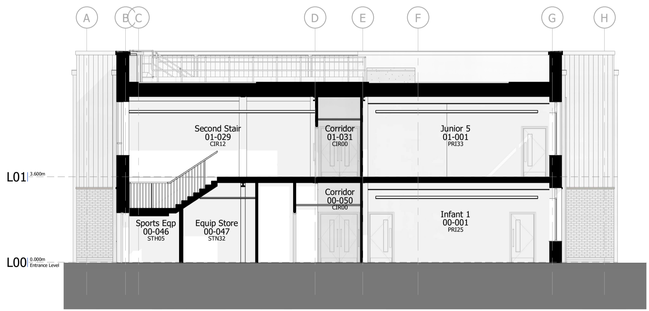
Section 2 1 : 100