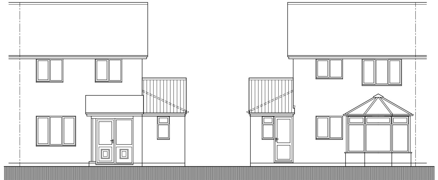
Front Elevation 1:50