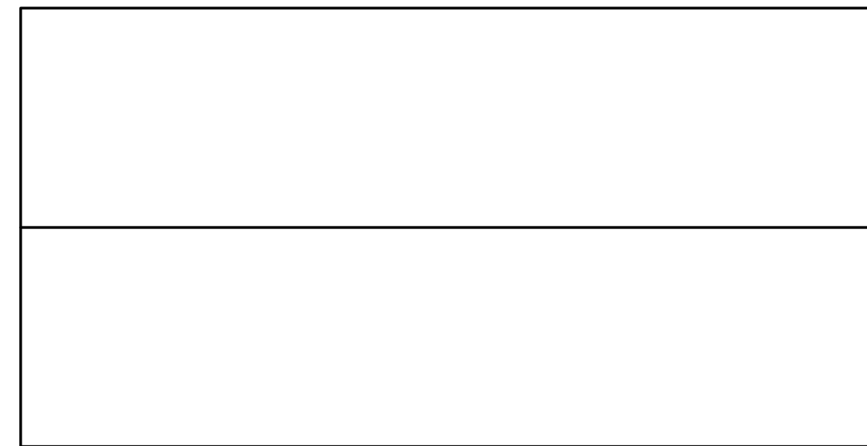
Proposed Roof Plan