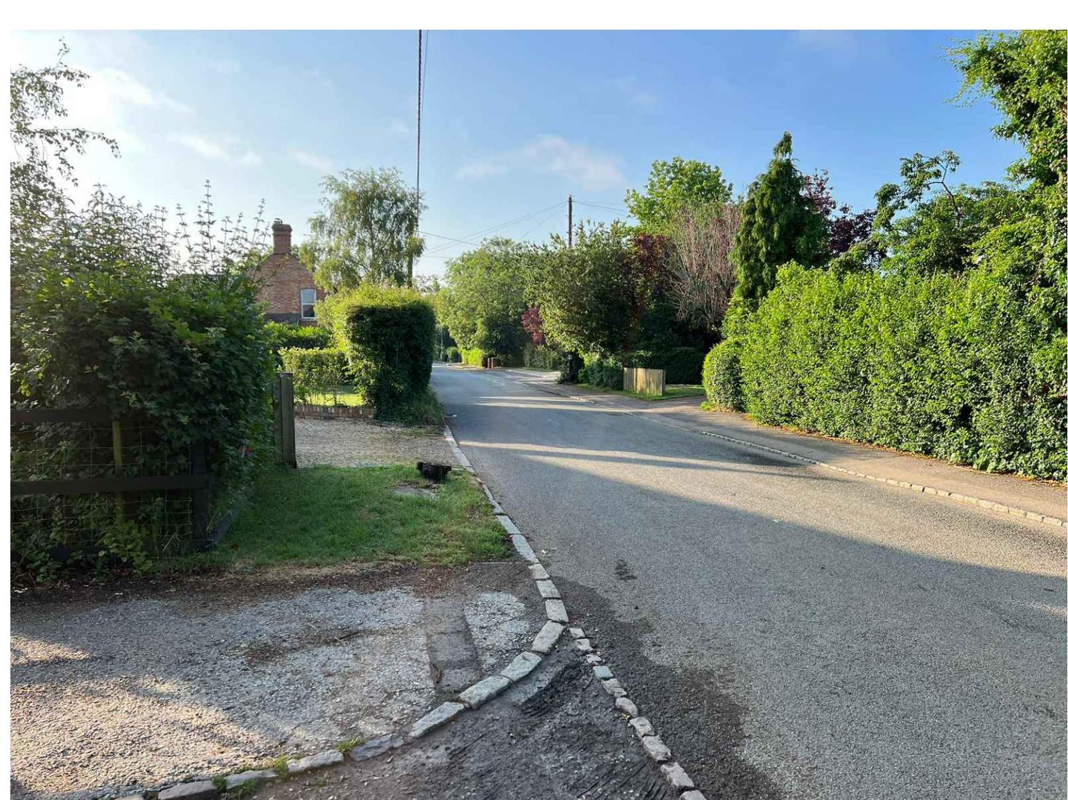
View 3. View from access facing east down Main Street