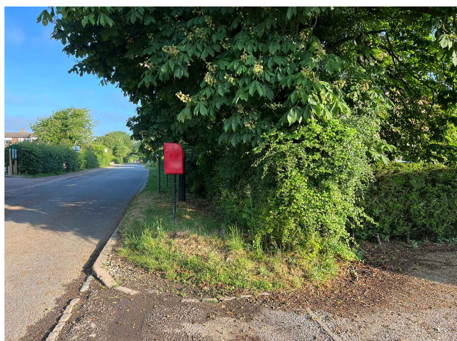
View 2. View from access facing west down Main Street.