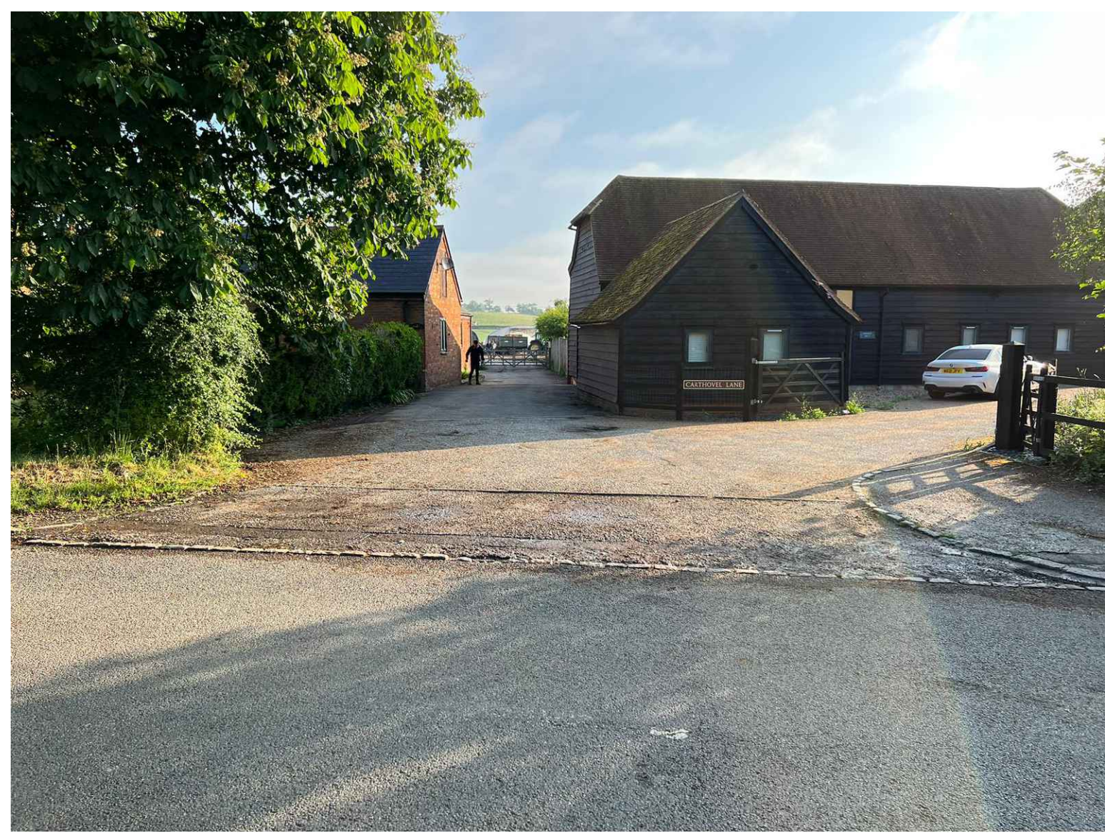
View 1. Existing access onto Main Street.