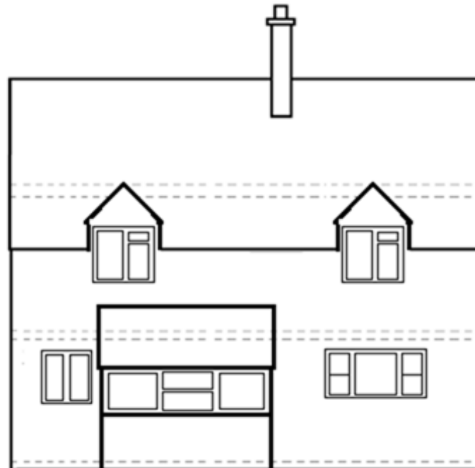
Front elevation ( unchanged )