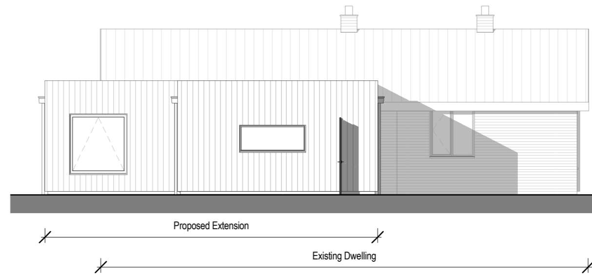
Proposed - Left (West) Elevation 1 : 100