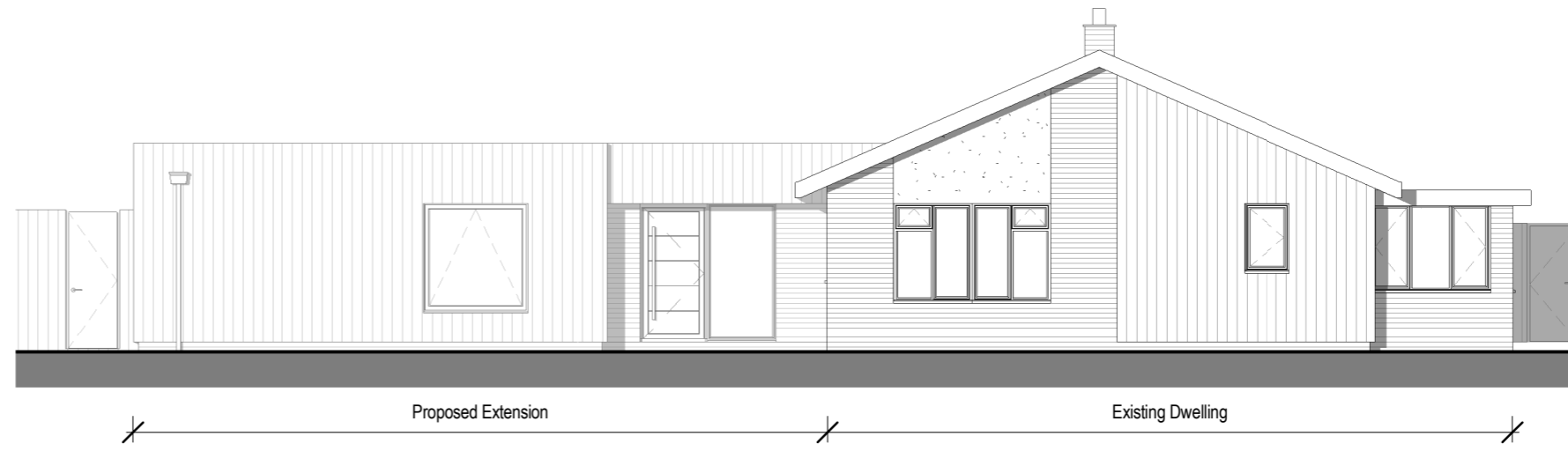
Proposed - Front (South) Elevation 1 : 100