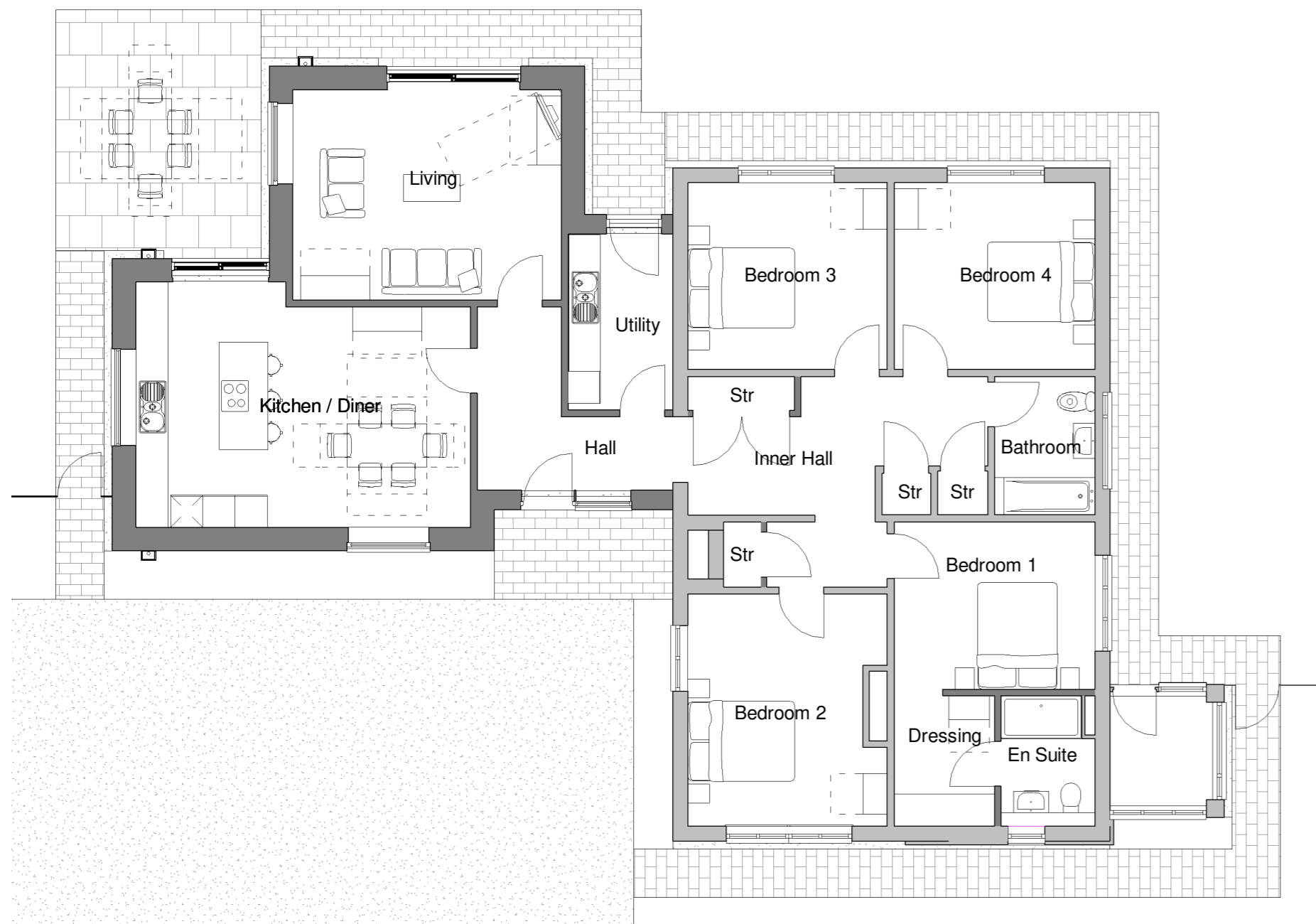
Proposed - Ground Floor Plan 1 : 100