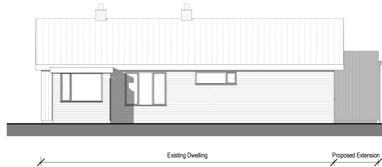
Proposed - Right (East) Elevation 1 : 100