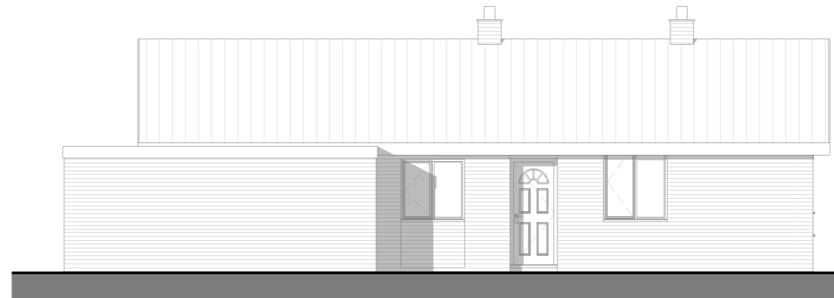
Existing - Left (West) Elevation 1 : 100