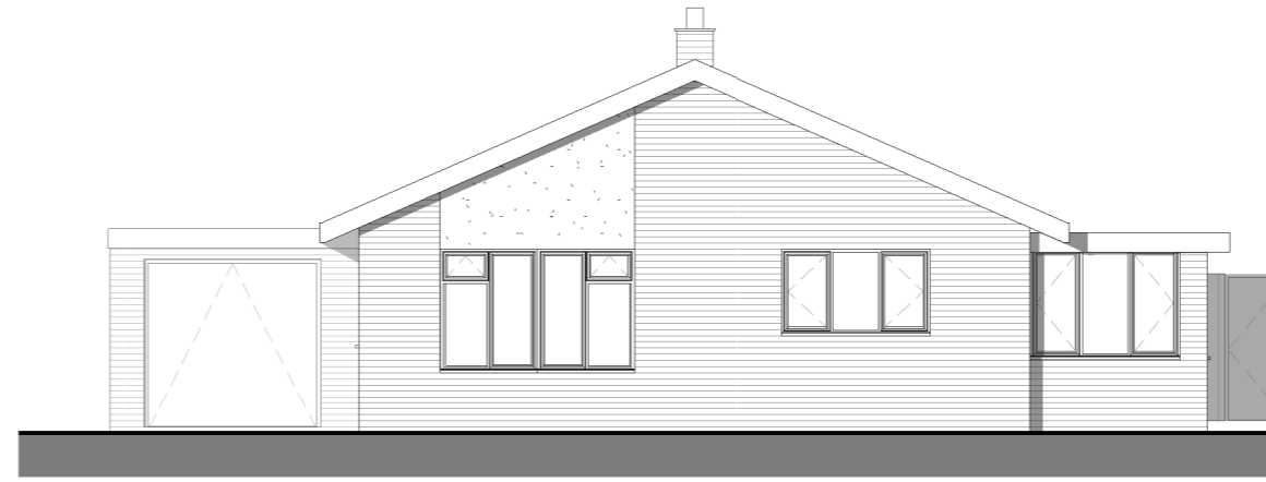
Existing - Front (South) Elevation 1 : 100