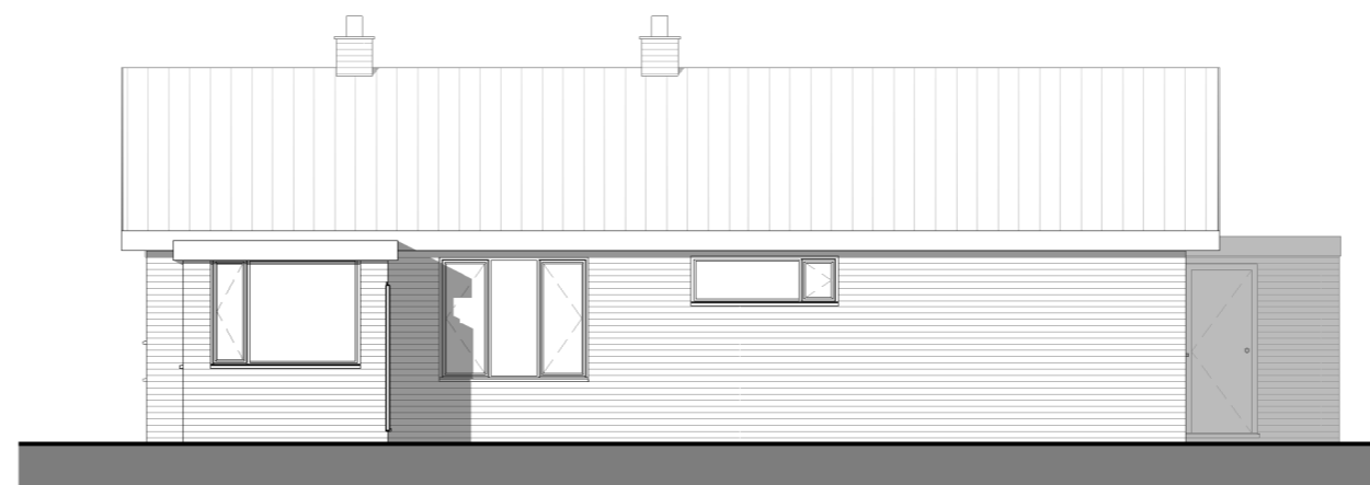
Existing - Right (East) Elevation 1 : 100