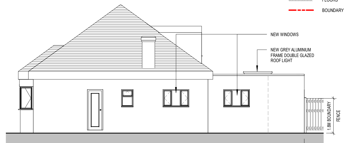
3 PROPOSED SIDE ELEVATION 1 : 100