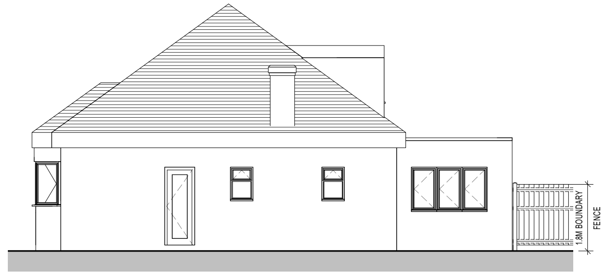
3 EXISTING SIDE ELEVATION 1 : 100