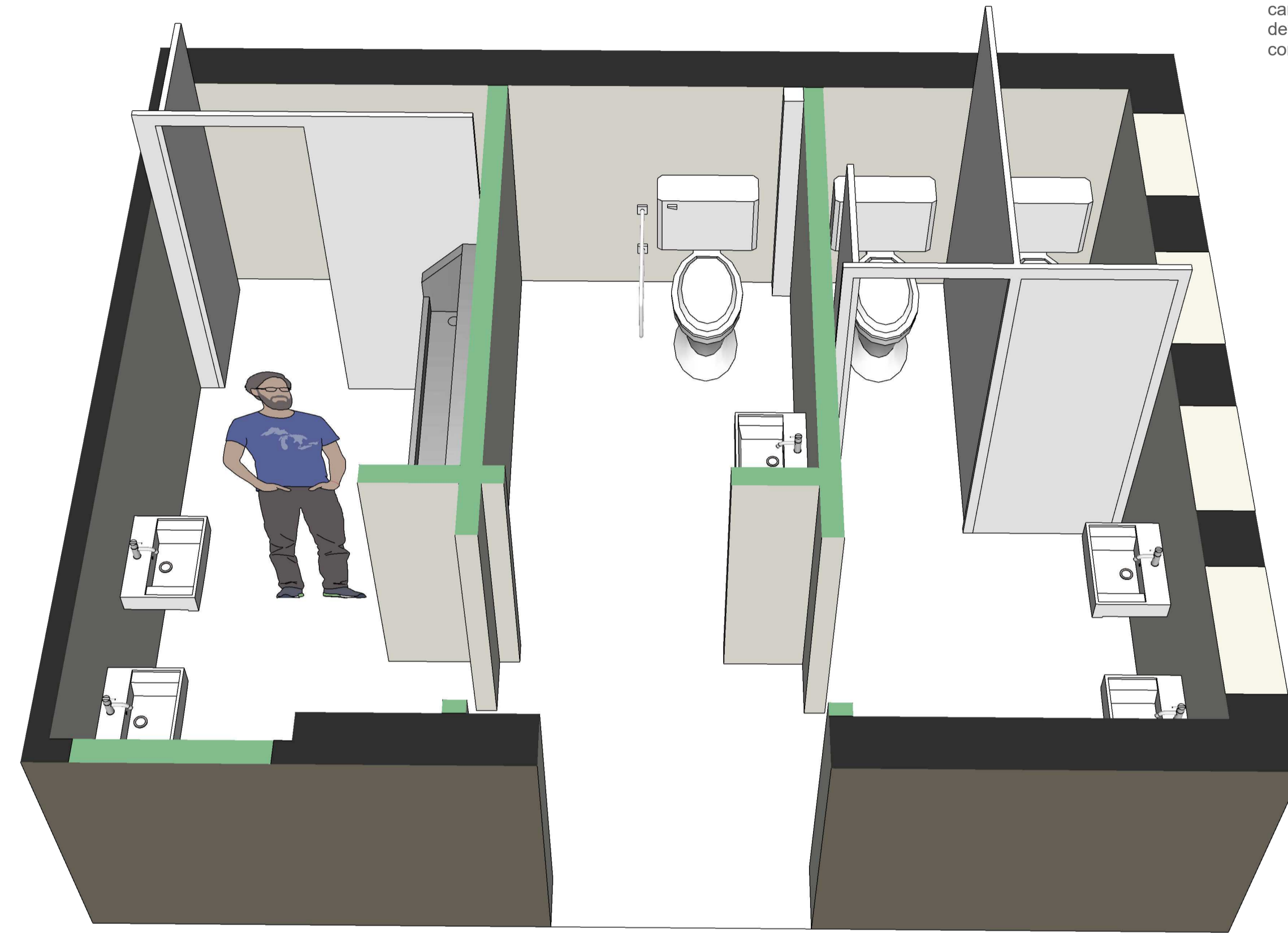
SECTIONAL TOILET MODEL Scale NTS

Green walls denote new studwork partitions