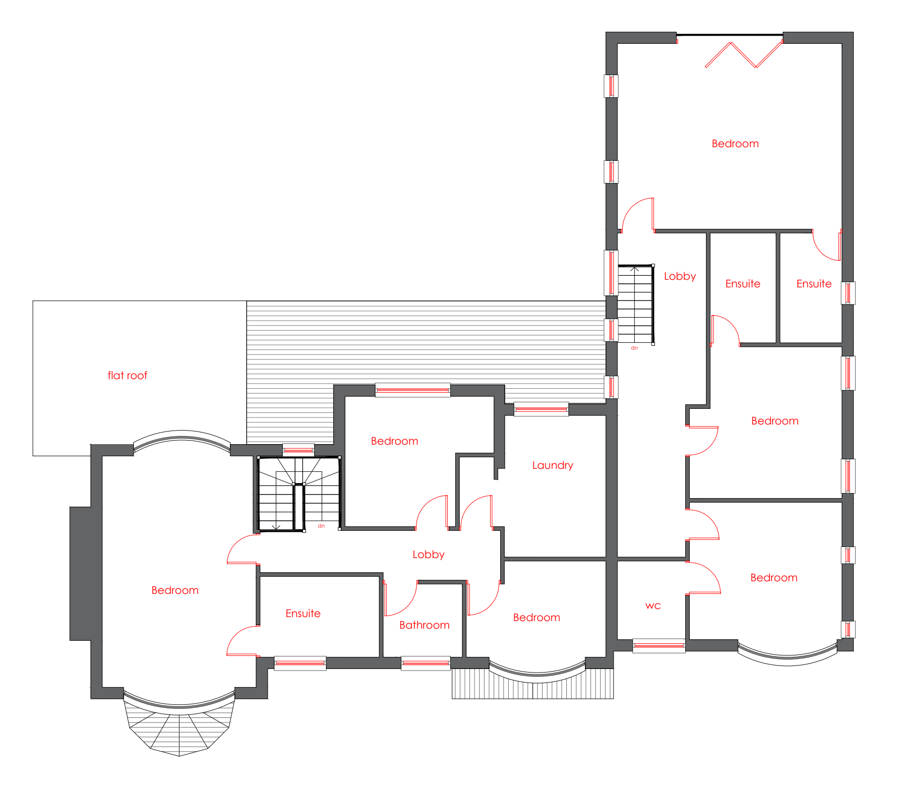
Existing First Floor