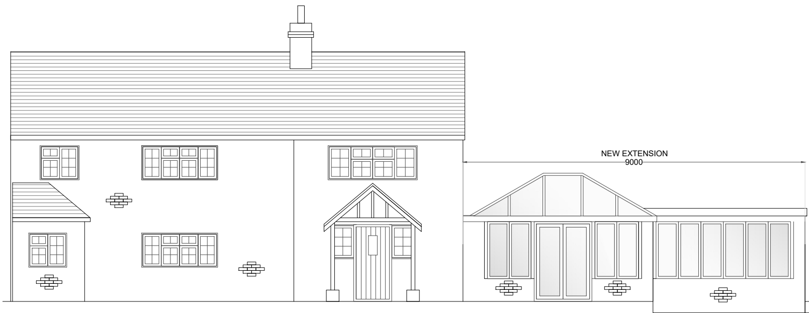
Proposed Front Elevation (with new porch)