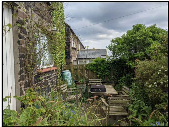
From front garden looking East