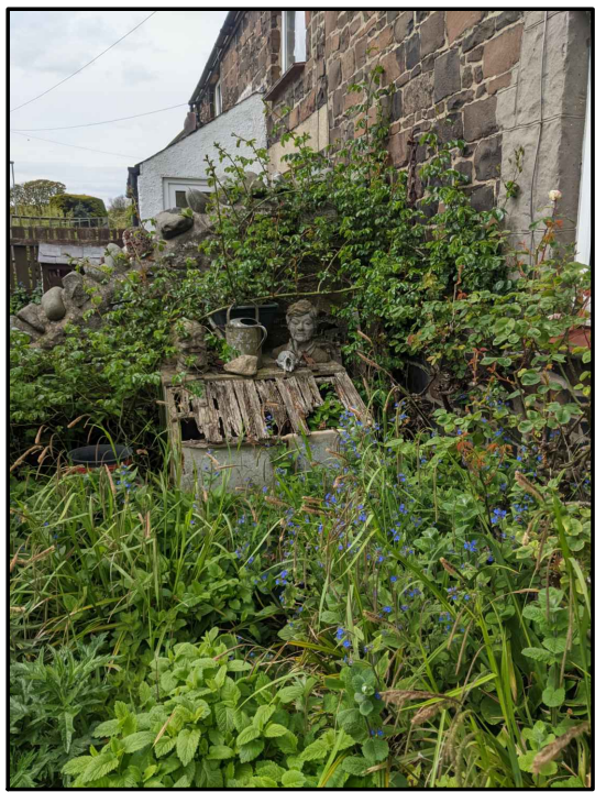
From front garden looking West