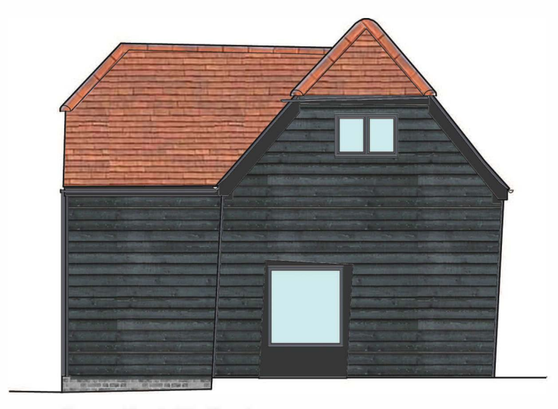
Proposed South Side Elevation