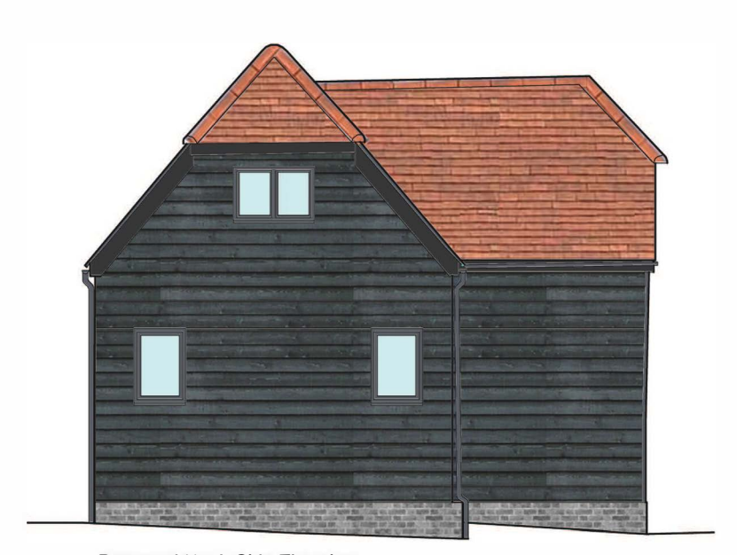
Proposed North Side Elevation