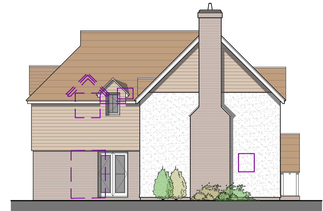
Elevation D AS PROPOSED HOUSE TYPE A 1:100