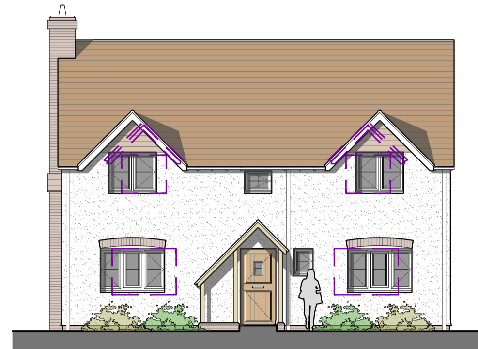
Elevation A AS PROPOSED HOUSE TYPE A 1:100