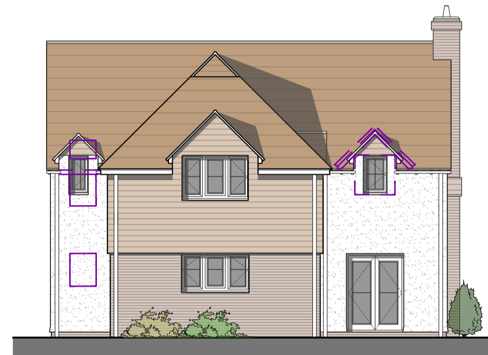
Elevation C AS PROPOSED HOUSE TYPE A 1:100