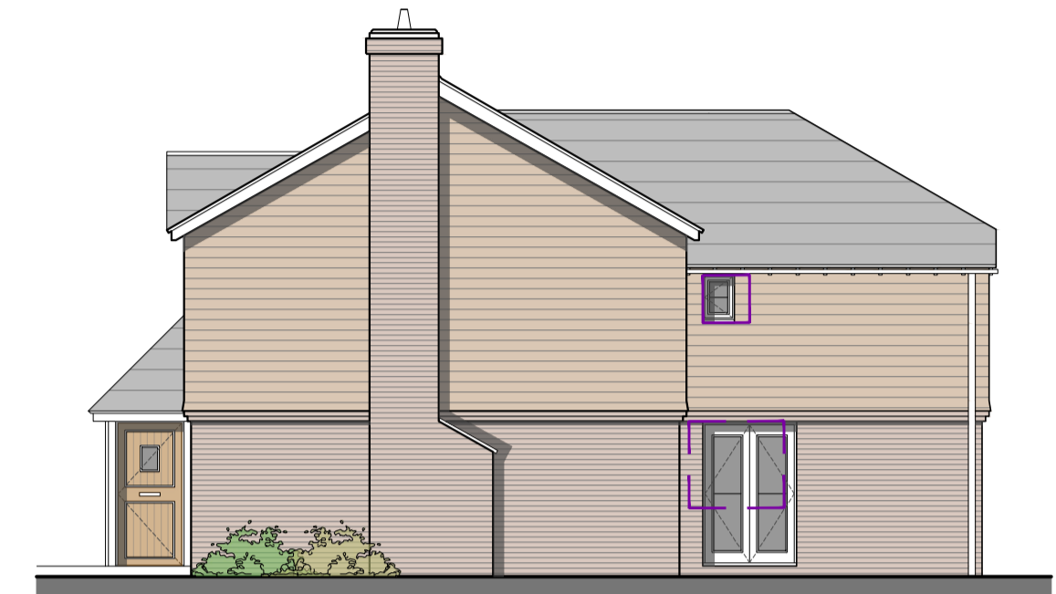
Elevation B AS PROPOSED HOUSE TYPE B