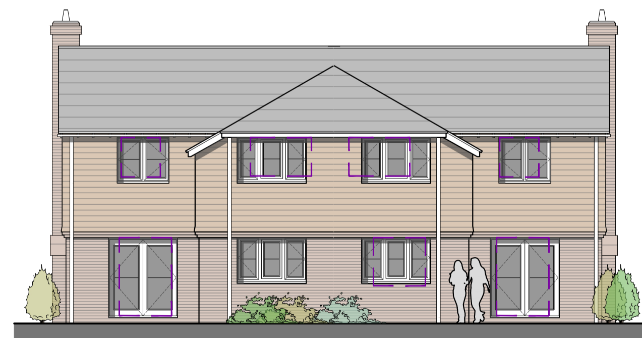
Elevation C AS PROPOSED HOUSE TYPE B