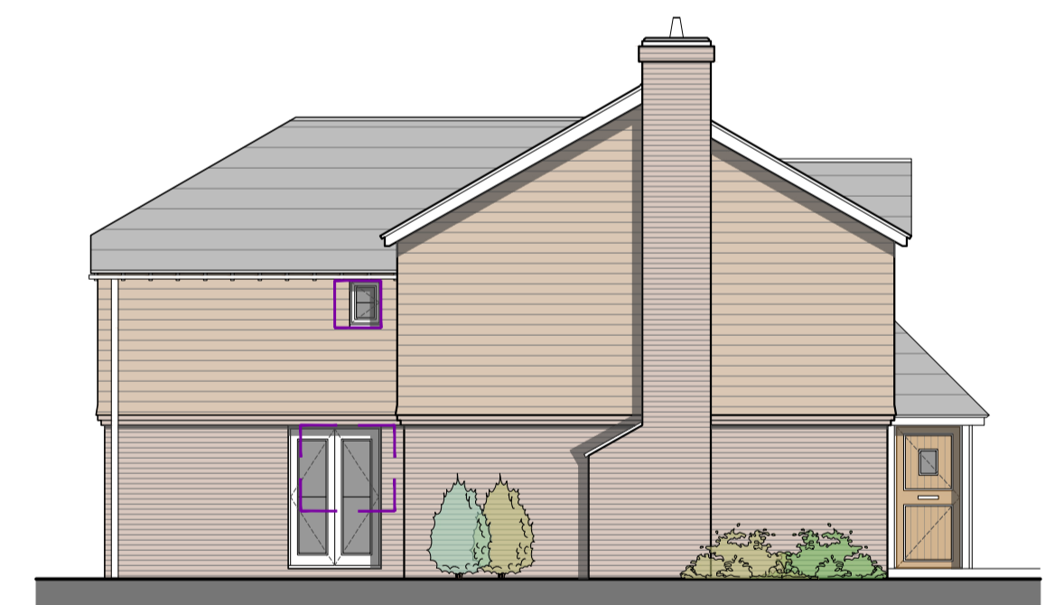
Elevation D AS PROPOSED HOUSE TYPE B