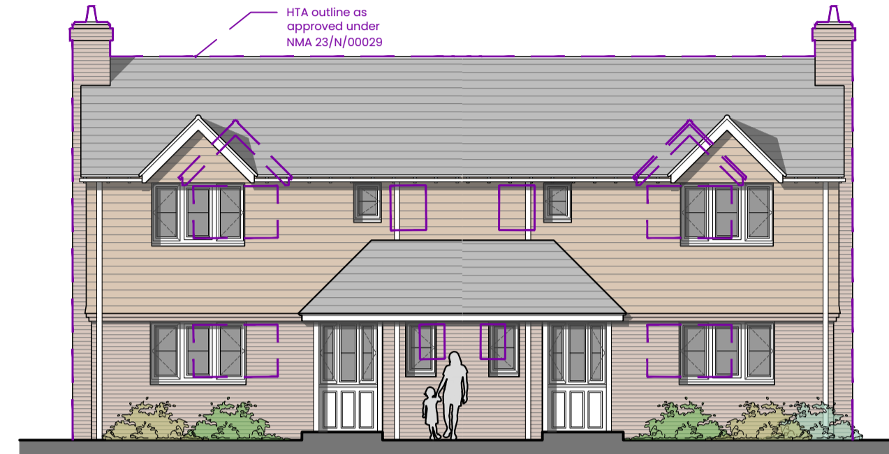
Elevation A AS PROPOSED HOUSE TYPE B