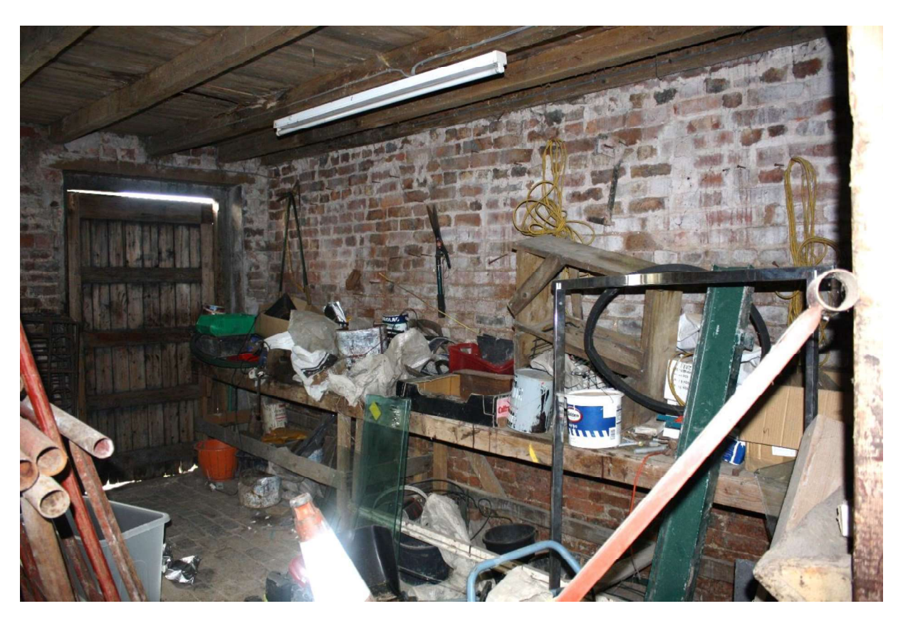
Plate 28 Storage room under a south hayloft, facing southeast.