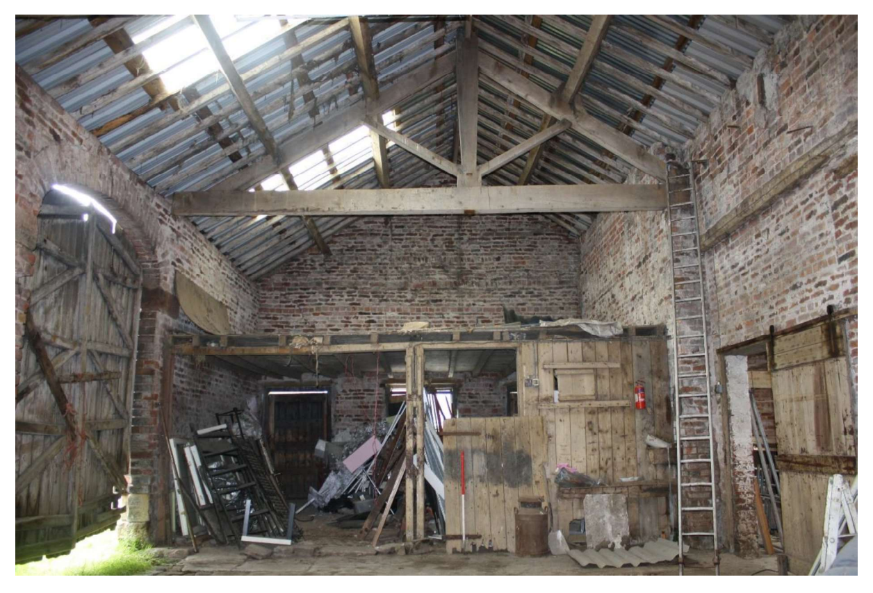
Plate 26 Interior of the barn facing south. Hayloft with stable door to the right.