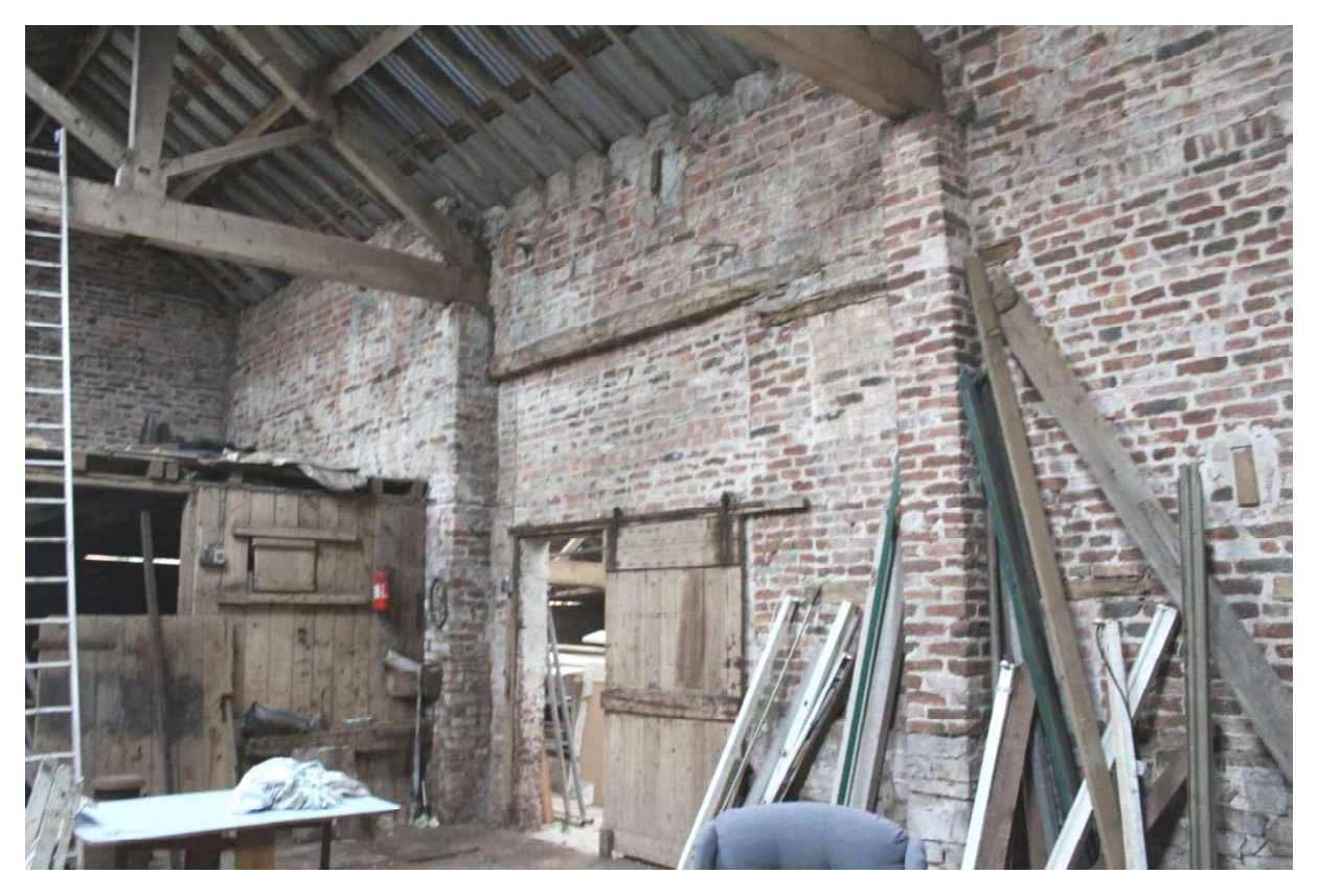
Plate 22 West internal elevation, facing southwest.