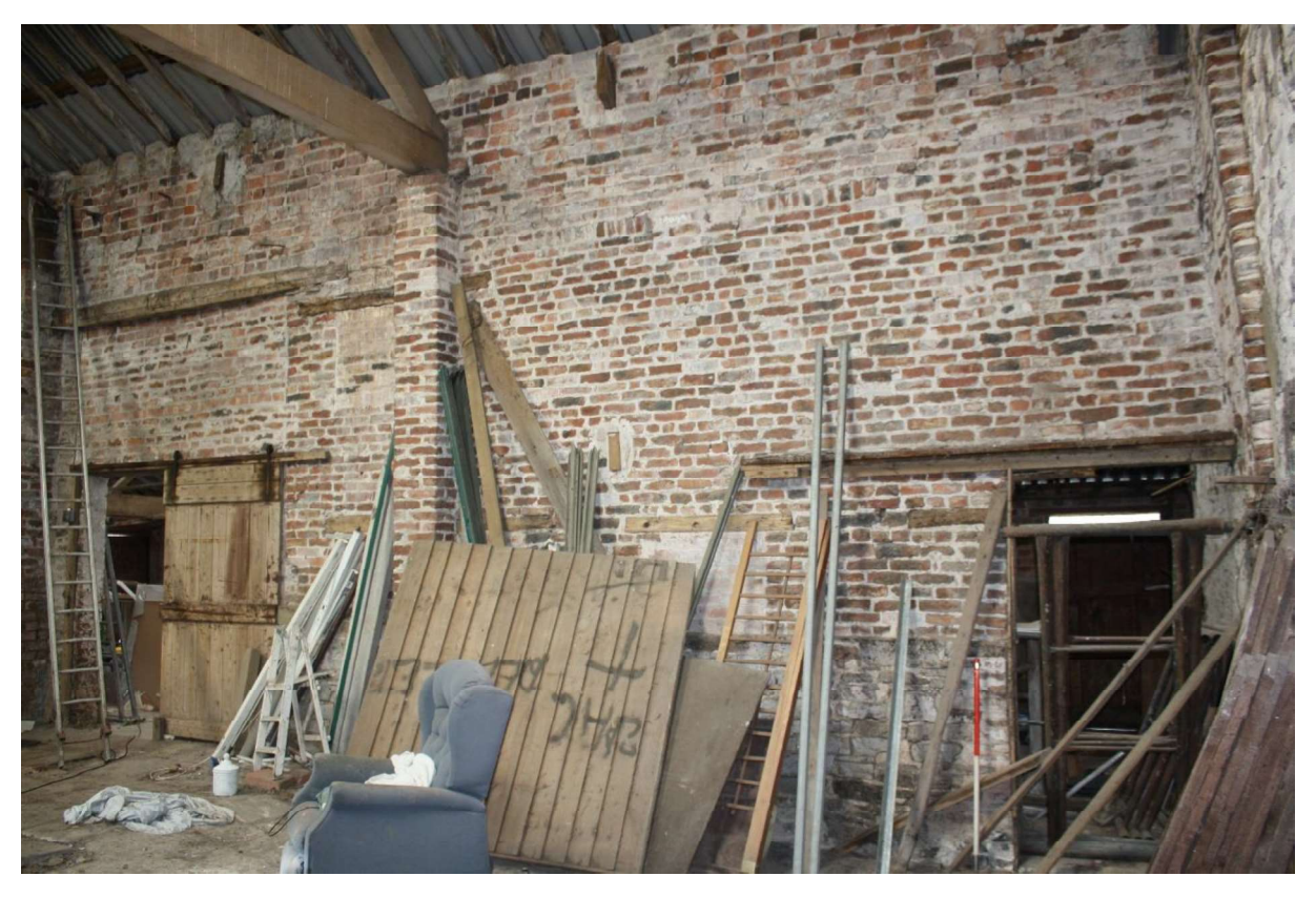
Plate 21 West elevation, facing southwest.