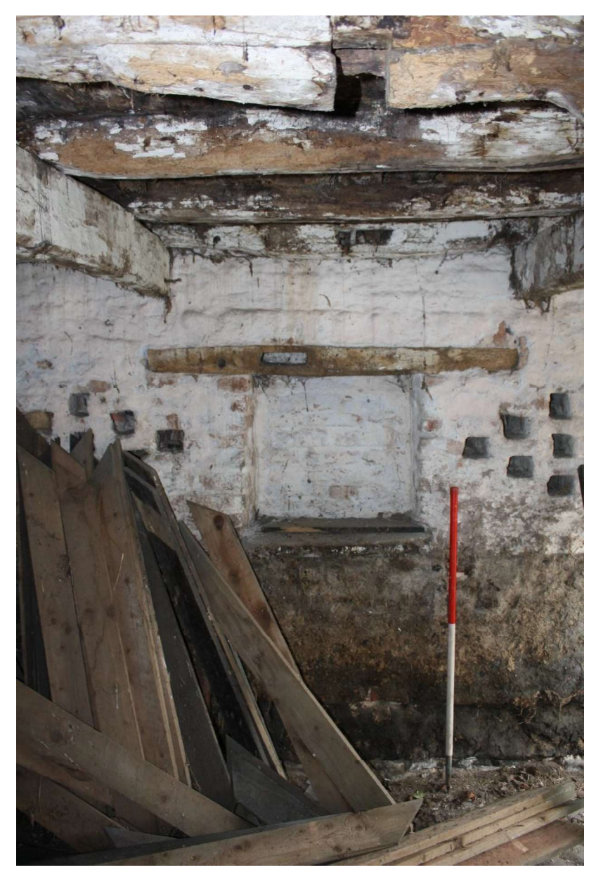
Plate 29 Blocked aperture and ventilation slots in the west elevation of the cowhouse.