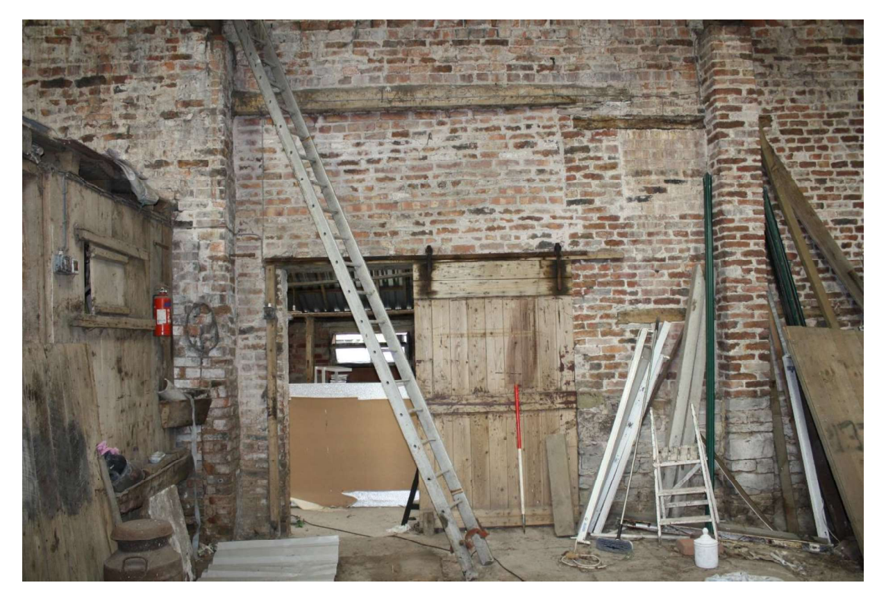
Plate 24 Modern replacement of the wagon door in the west elevation, facing west.