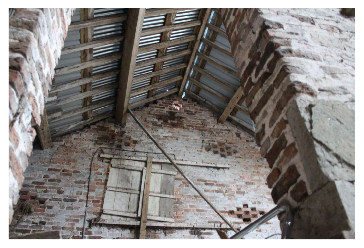
Plate 16 North gable with sliding pitching door.