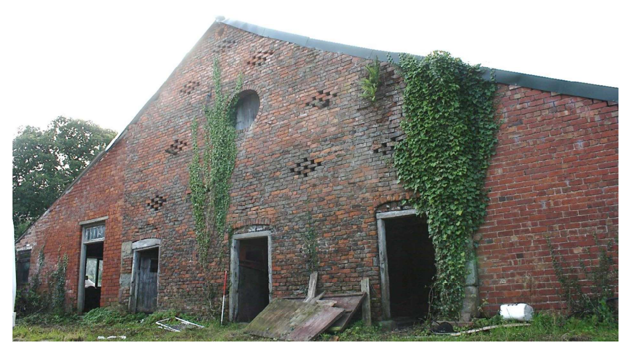
Plate 13 North elevation of the barn, facing southeast.