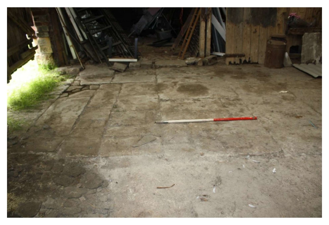
Plate 19 Threshing floor, facing south.