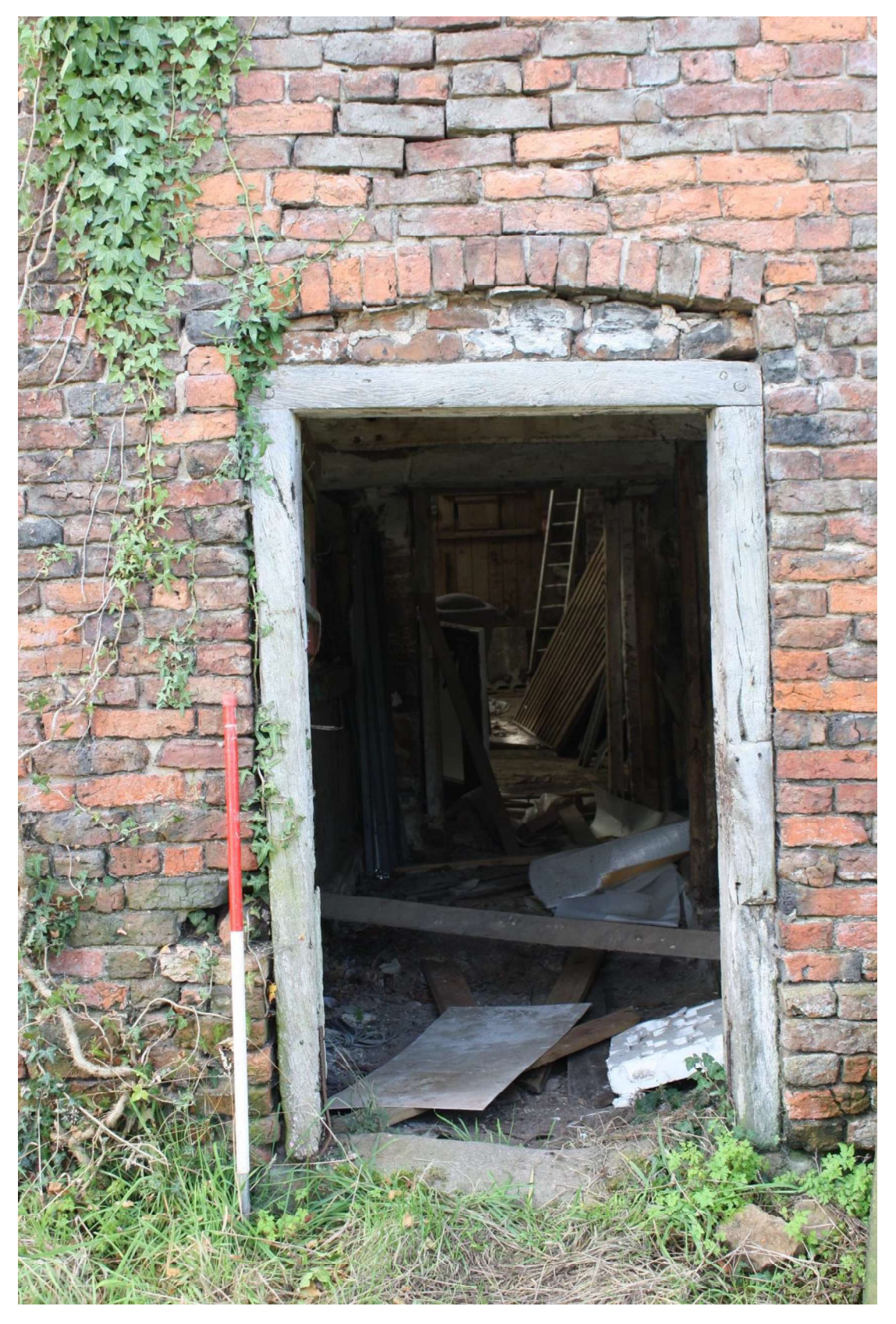
Plate 14 Central doorway in the north elevation of the barn.