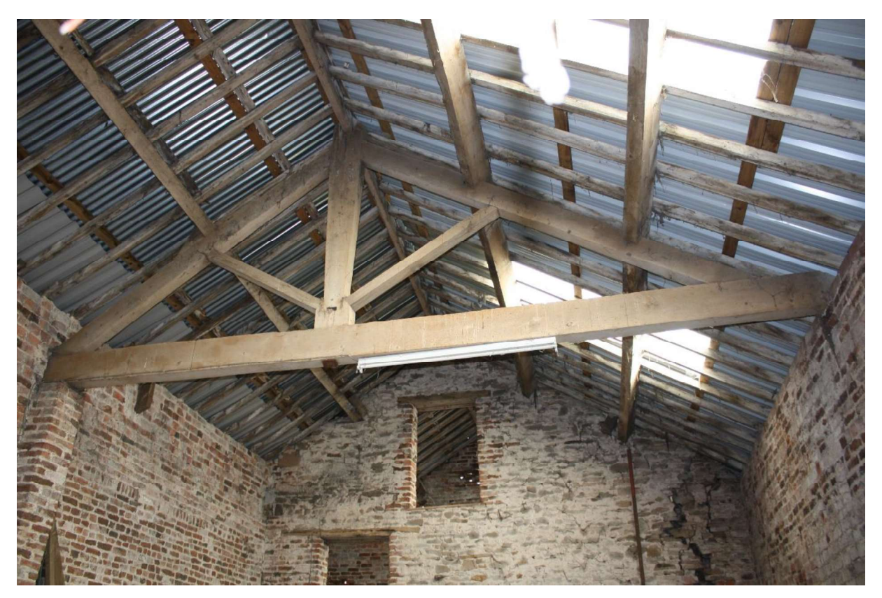
Plate 20 King post truss supported on a brick pillar.