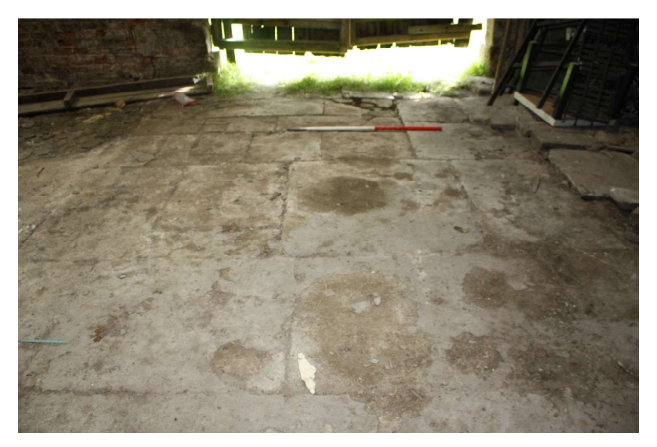
Plate 18 Flagged threshing floor, facing east.