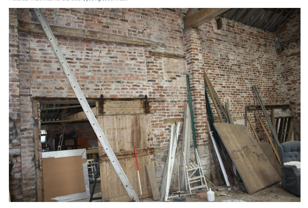
Plate 23 West internal elevation facing northwest.