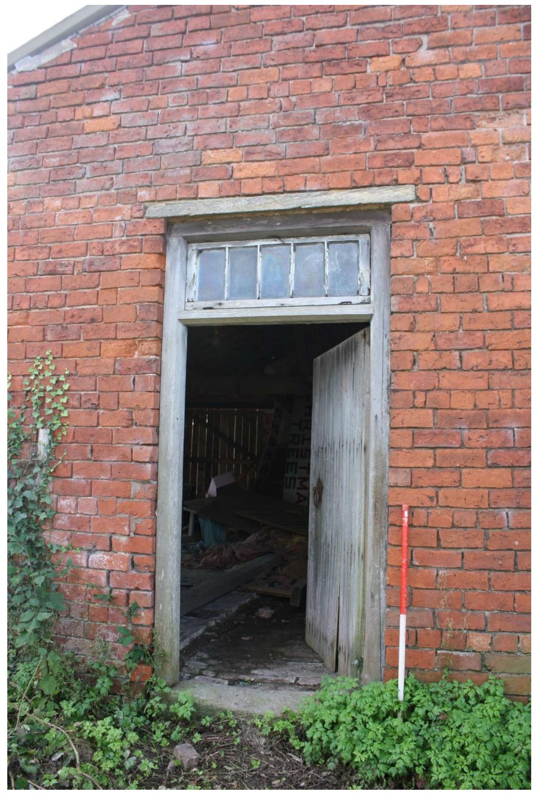
Plate 10 Door with transom window in the east outshut.