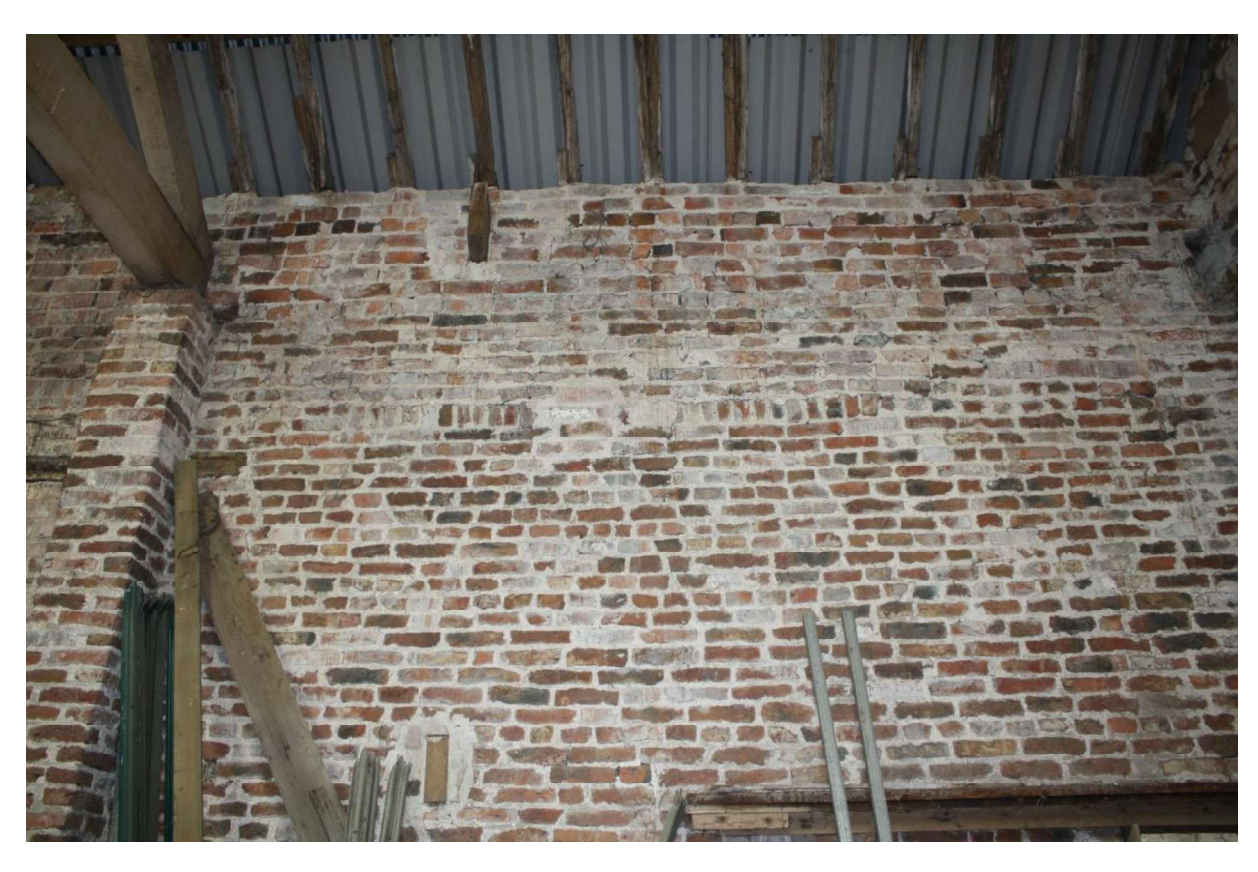
Plate 25 Fragment of west internal elevation with two lines of rowlock course inserted.