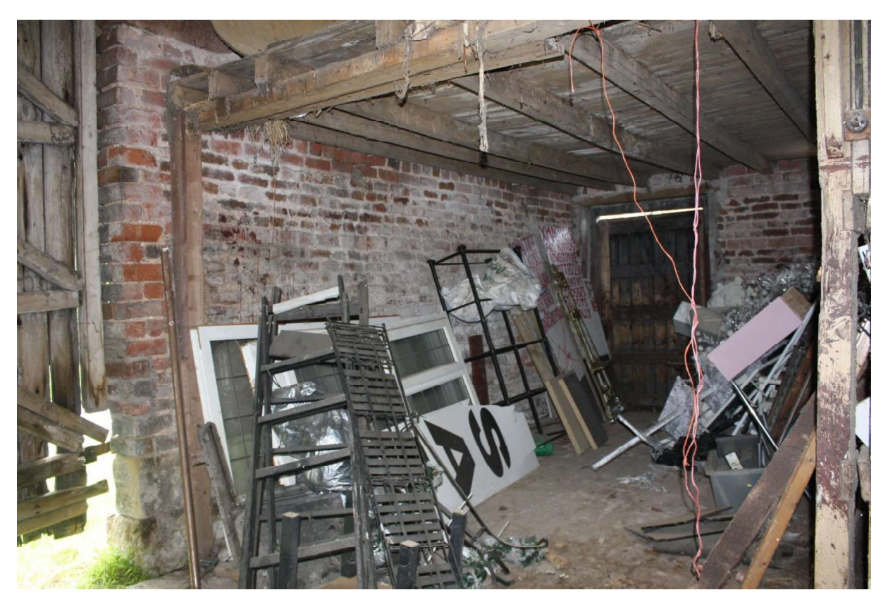
Plate 27 Storage room under a south hayloft, facing southwest.