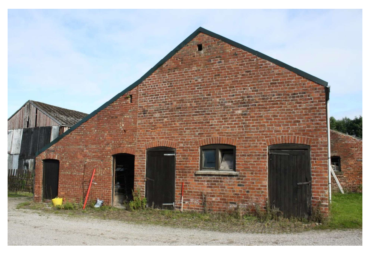
Plate 1 South elevation of the barn, facing northwest.