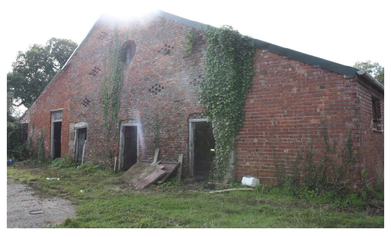
Plate 9 North elevation of the barn, facing southeast.