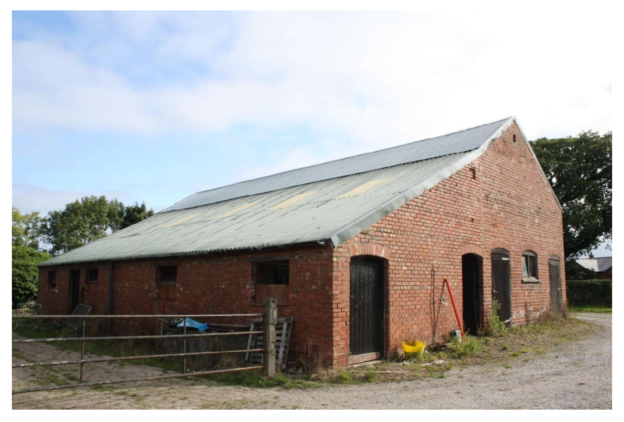
Plate 6 West elevation of the barn, facing northeast.