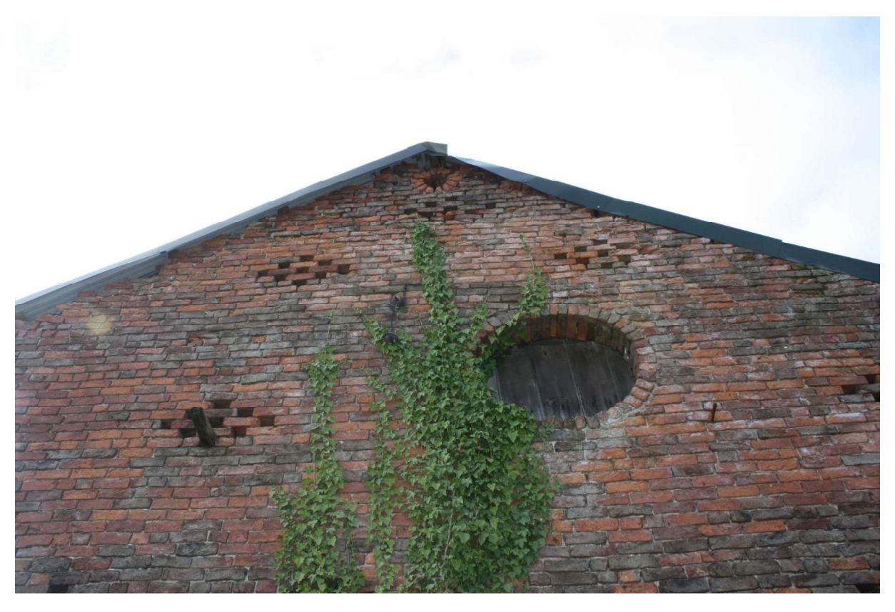
Plate 12 North elevation with a pitching eye and ventilation slots.