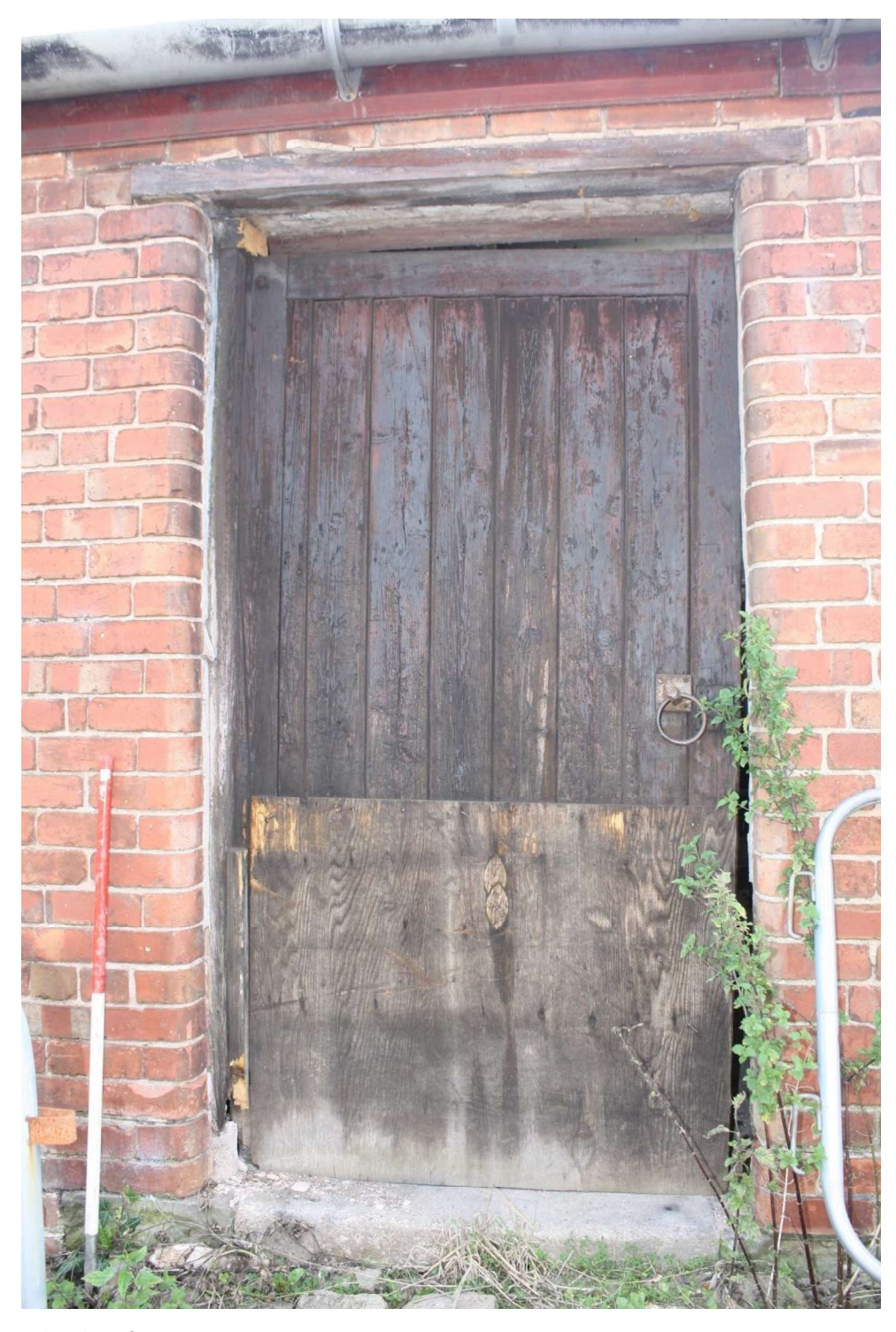
Plate 8 West outshut door, facing east.