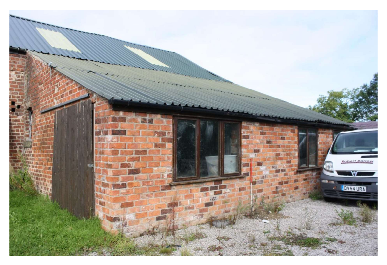
Plate 5 Modern outshut in the north part of the east elevation, facing northwest.