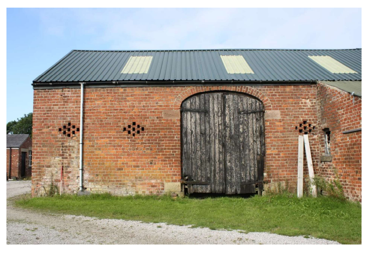
Plate 4 South part of the east elevation, facing west. The large wagon door displays the evidence of lowering of the roof.