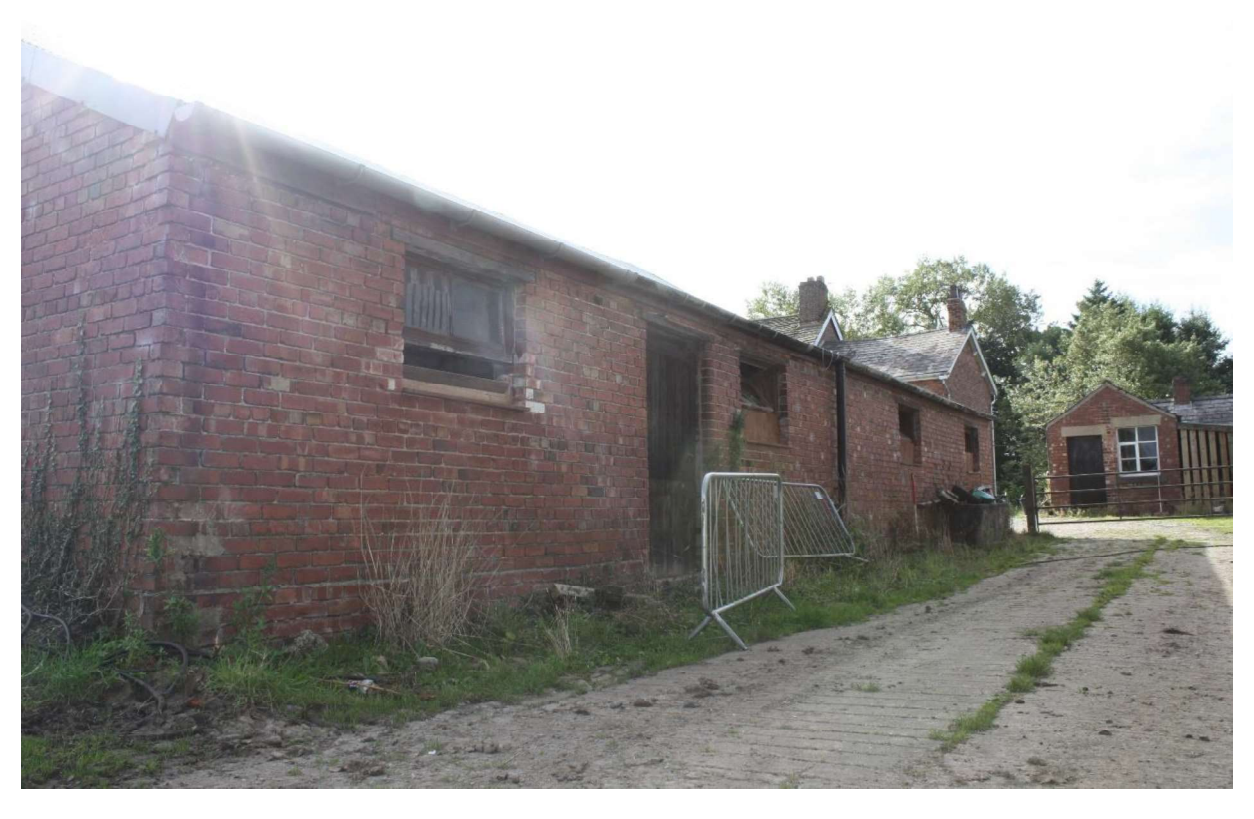
Plate 7 West elevation of the barn, facing southeast.