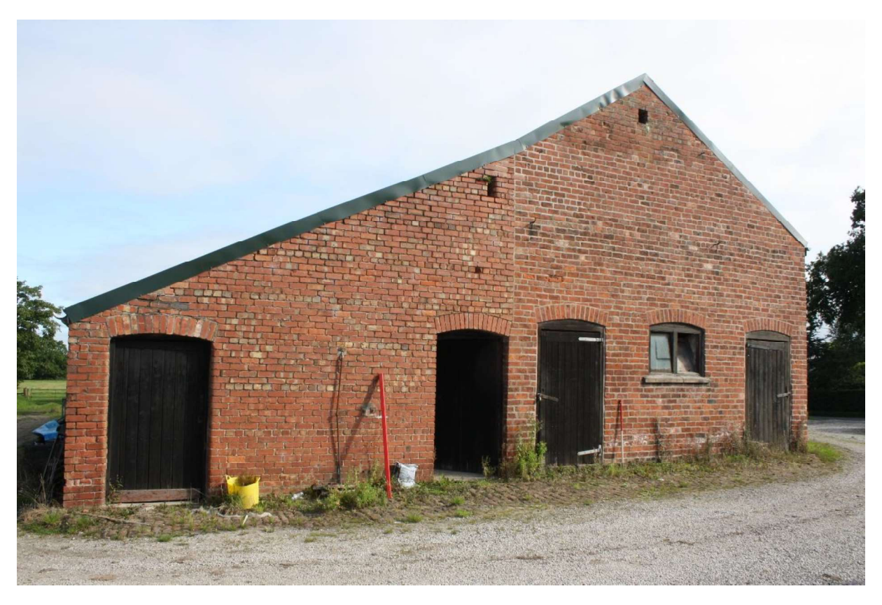
Plate 2 South elevation of the barn, facing northeast. Outshut to the east is a later addition.