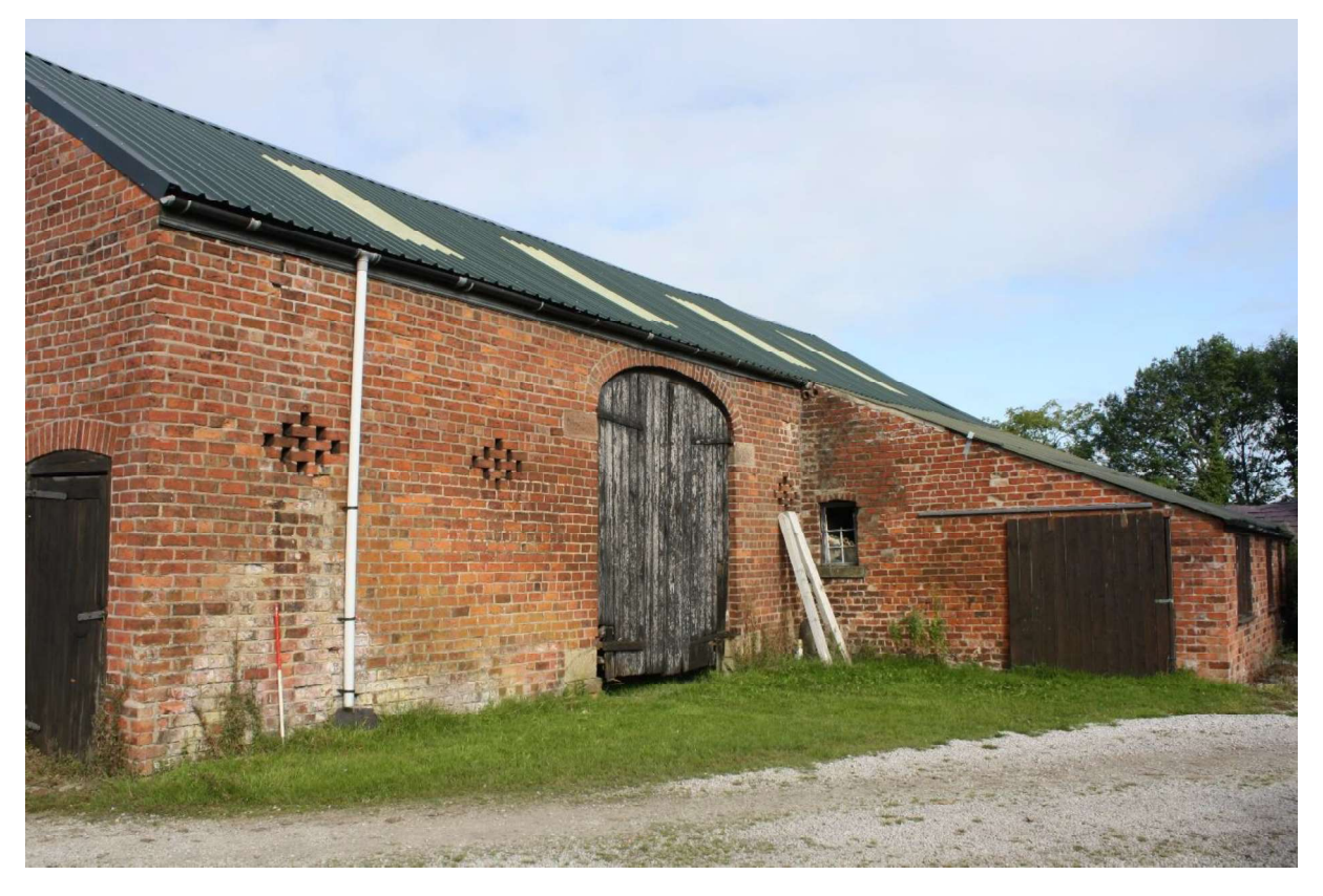
Plate 3 East elevation of the barn, facing northwest.