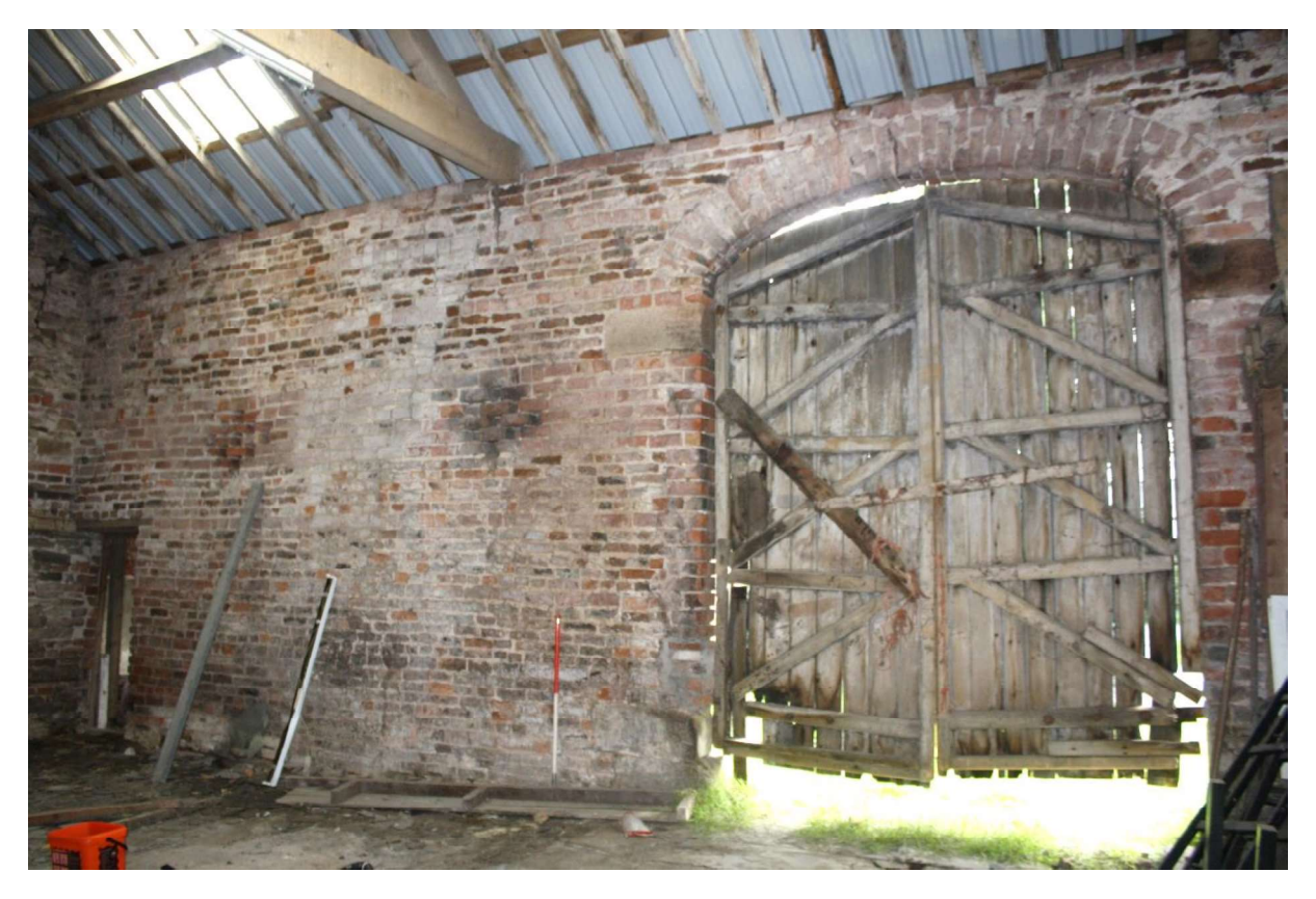
Plate 17 East internal elevation with wagon door, facing northeast.